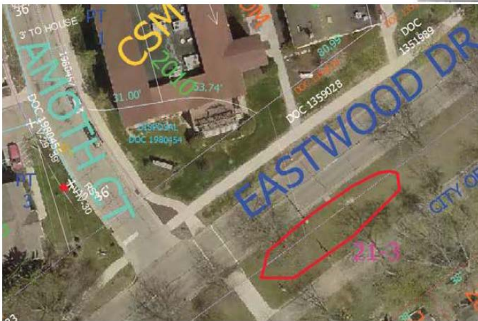
EXHIBIT A (Page 1 of 2) "Cowboy" Location #14