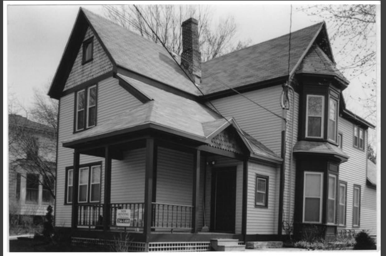
2001 survey photo