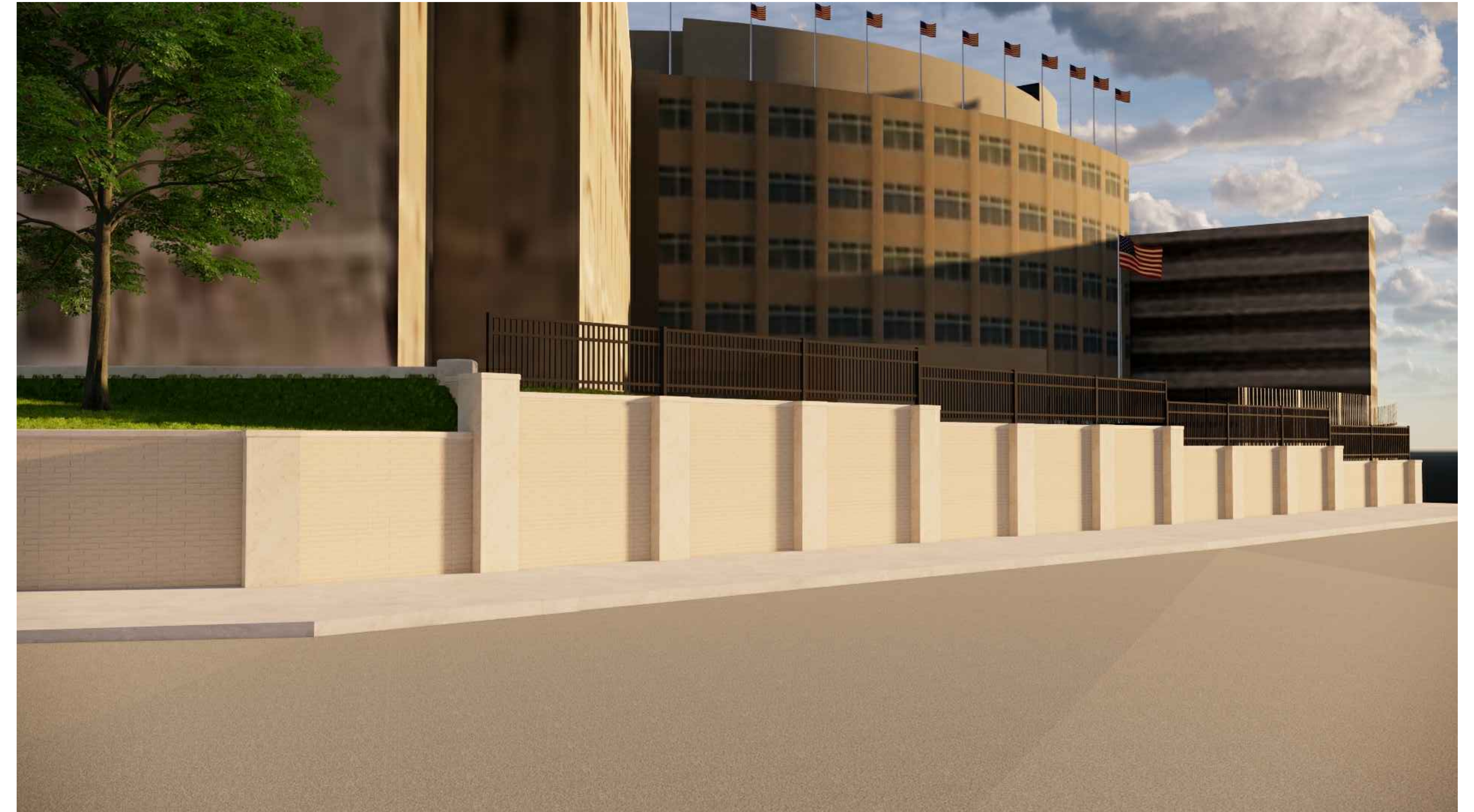
2 RETAINING WALL ALONG MONROE STREET