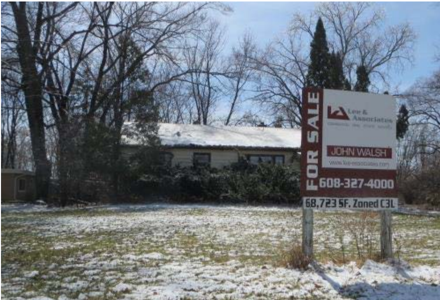
City Assessor's Office

Originally constructed as a single family home in 1951. Property class changed to commercial in 2007; zoned for industrial use.