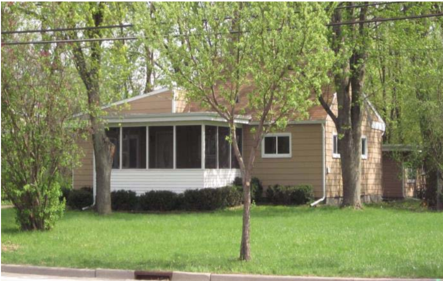
City Assessor's Office

Originally constructed as a single family home in 1940. Property class changed to commercial; zoned for industrial use.