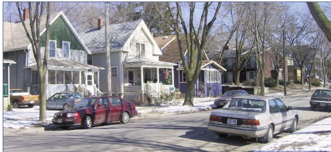
Figure 29: East Washington Avenue Character

In order to achieve a consistent and cohesive appearance along East Washington Avenue, as well as a diverse and interesting Avenue environment, some urban design elements should be consistent and others should vary.