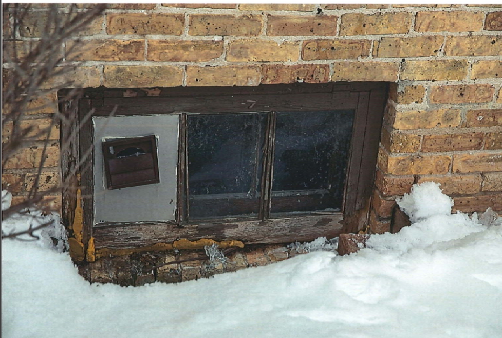
Rotted Basement Window