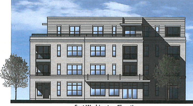
East Washington Elevation