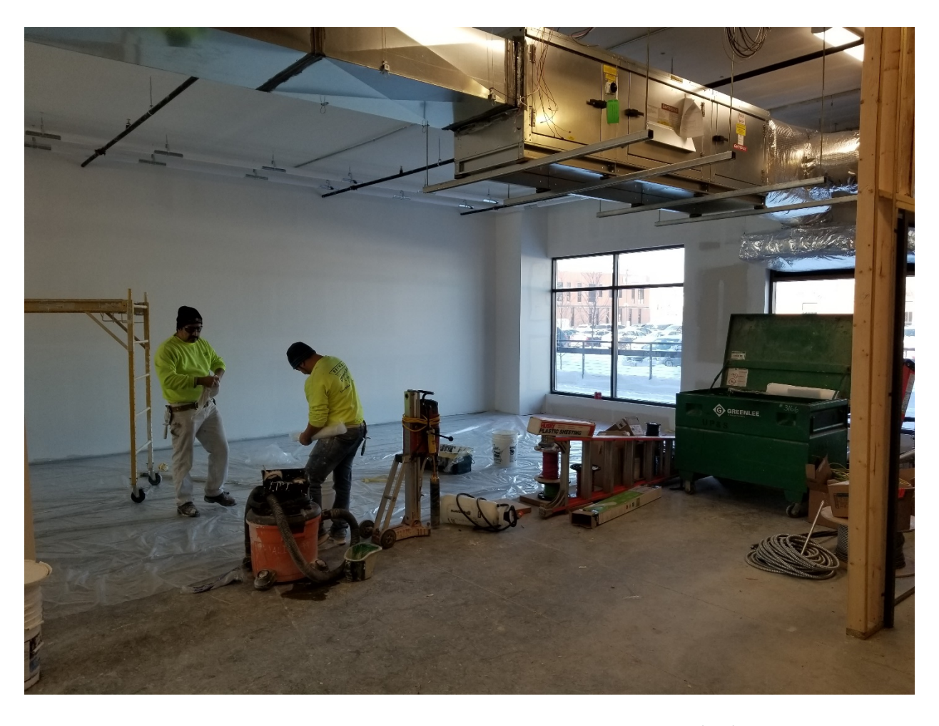
Back area being prepped for installation of 2 walkin coolers to be done on 2/15/19