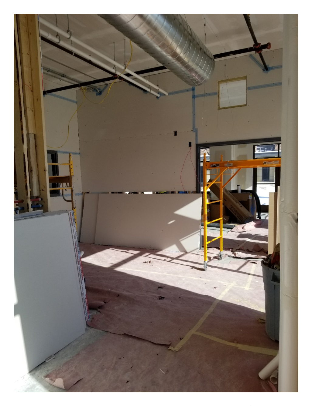
Brewspace plumbing and electrical completed, putting up FRP/drywall