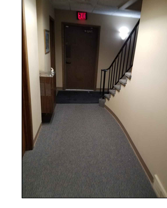
5 EXISTING BUILDING- 330 INTERIOR IMAGE SCALE: NOT TO SCALE