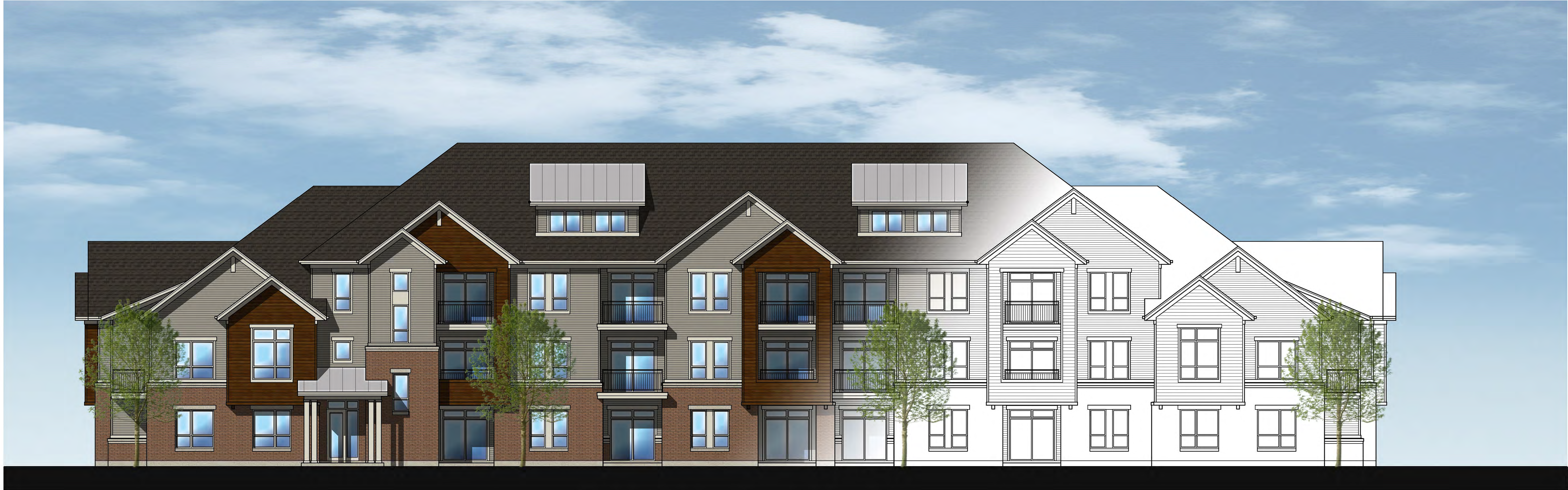
1 FRONT ELEVATION - BUILDING 8 A-1.1 1/8" = 1'-0"