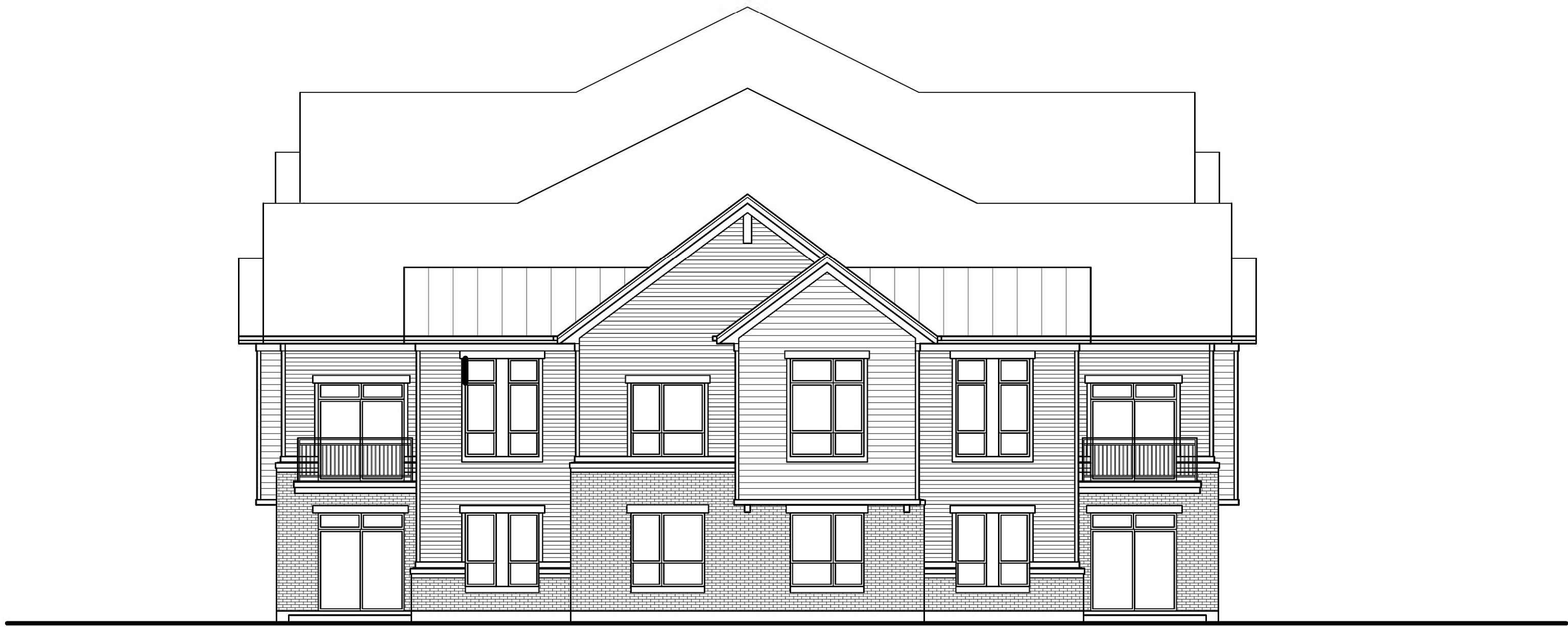
2 SIDE ELEVATION - BUILDING 8 A-1.1 1/8" = 1'-0"