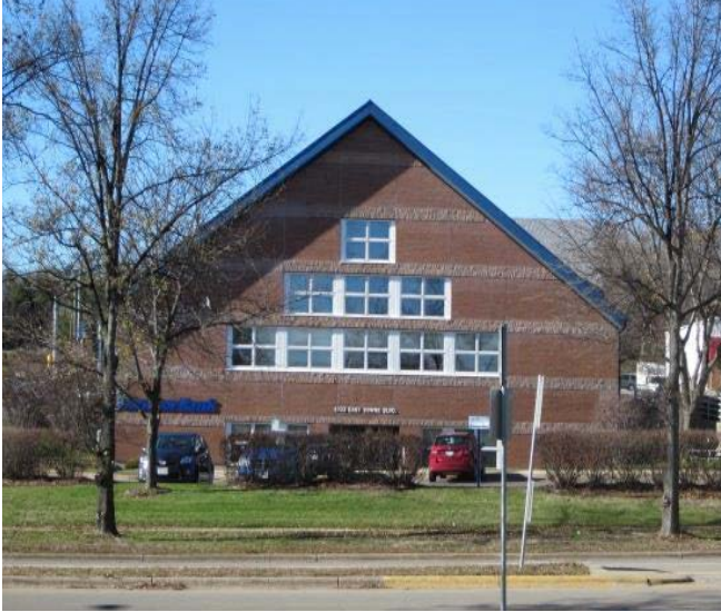
City Assessor's Office

Commercial building constructed in 1988.