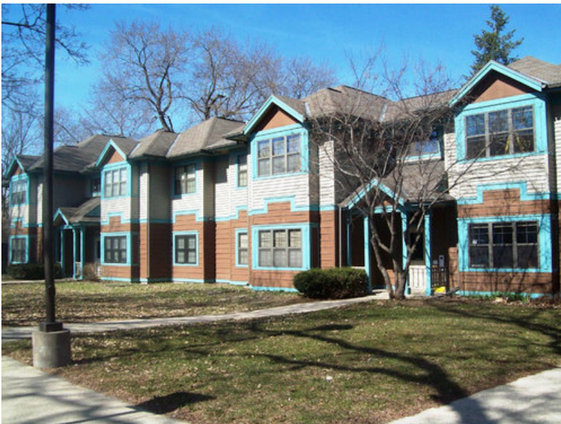
Madison Development Corporation website