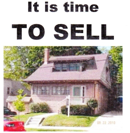
Free Market Analysis and Home Evaluation When people mention crazy neighbors, this house is the poster child, completely unhinged Wouldn't recommend anyone live next to this craziness

Photo 3: Targeted harassing mail sent to home address with photo of our home on it. (Text reads: It is time TO SELL Free Market Analysis and Home Evaluation When people mention crazy neighbors, this house is the poster child completely unhinged Wouldn't recommend anyone living next to this craziness.)