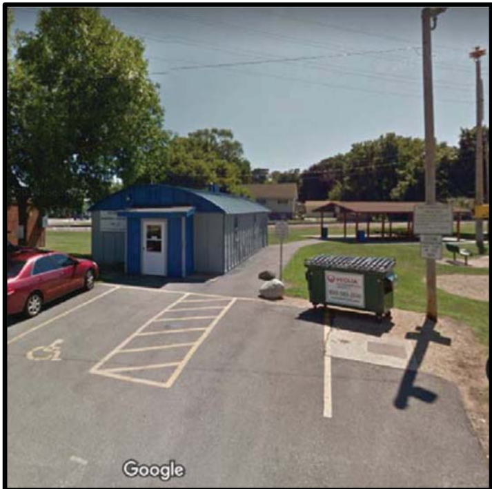
Image of Quonset Hut