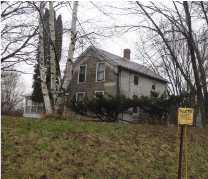
City Assessor's Office

Originally constructed as a single family home in 1869. Property class changed to commercial in 2017; zoned for industrial use.