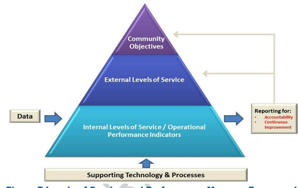
Figure 7 Levels of Service and Performance Measure Framework

Figure 7 shows the relationship between output objectives, External LOS, Internal LOS, data, and underlying technology tools. A LOS framework identifies the metrics that have the most significant and direct impact on service delivery to customers and stakeholders. It also enables utility organizations to track trends, report progress against targets, and make critical adjustments when necessary.