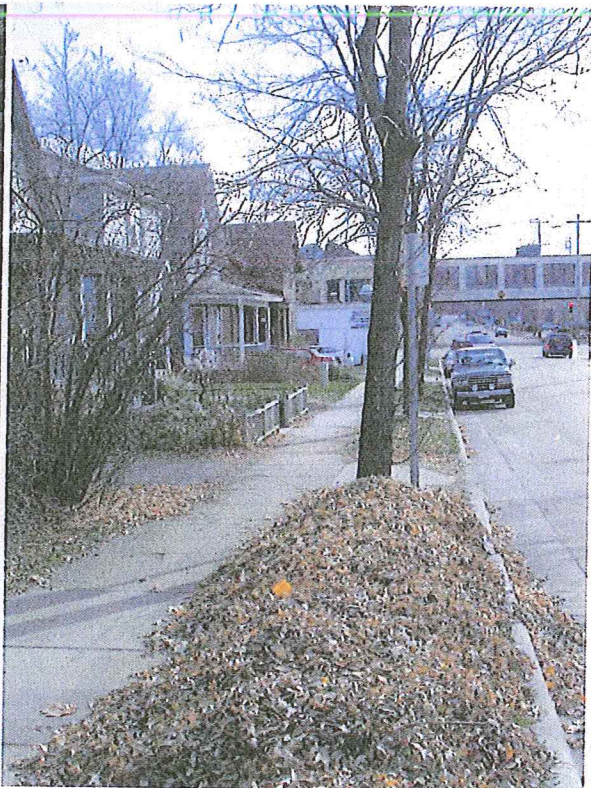
5-foot terrace: snow, leaves, utility poles, and traffic signs are all competing for space