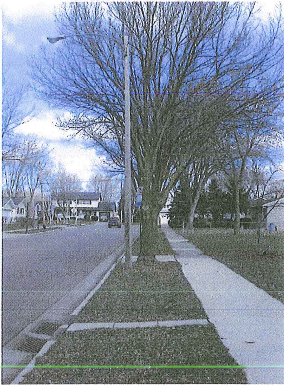
7-foot terrace: a 22-inch ash tree still has room to grow.