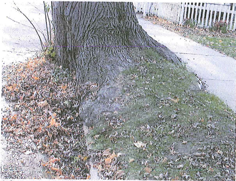
4-foot terrace: tree has grown into street