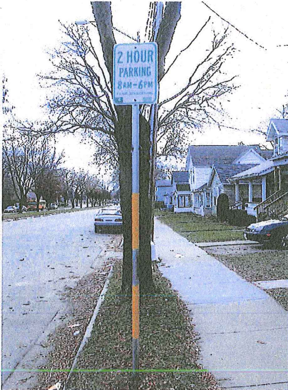
5-foot terrace: sidewalk recently repaired on 22-inch locust.