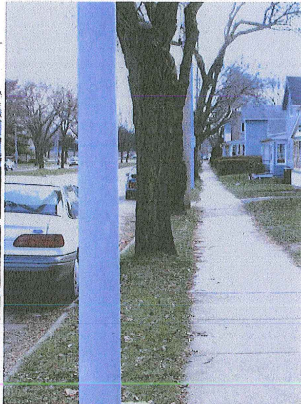
5-foot terrace: 22 inch locust with recently repaired sidewalk.