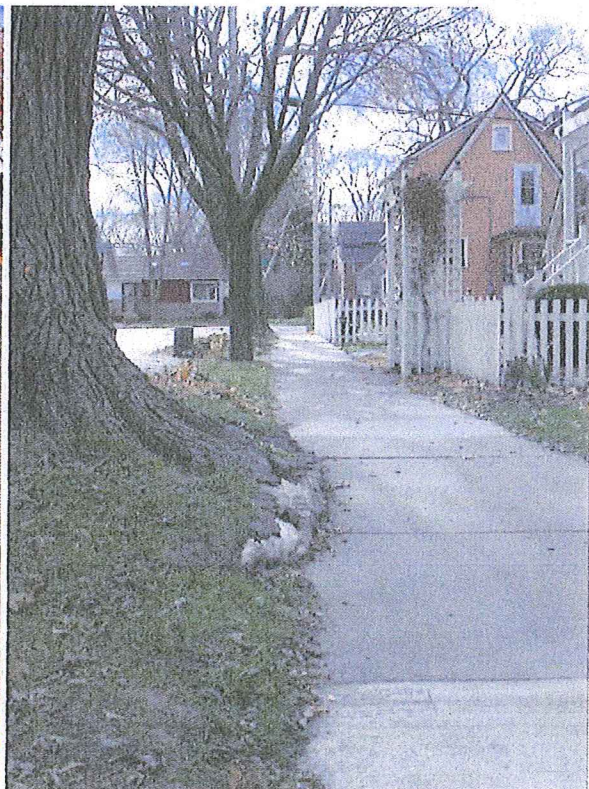
4-foot terrace: roots lifting up sidewalk