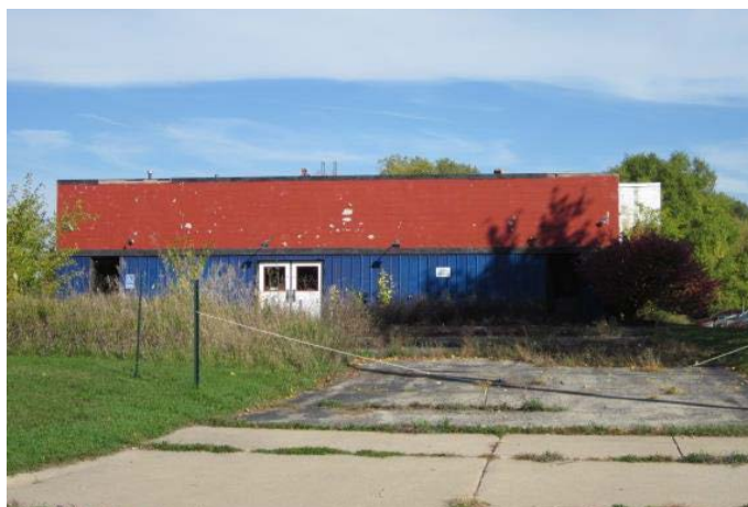
City Assessor's Office

Commercial building constructed in 1959.