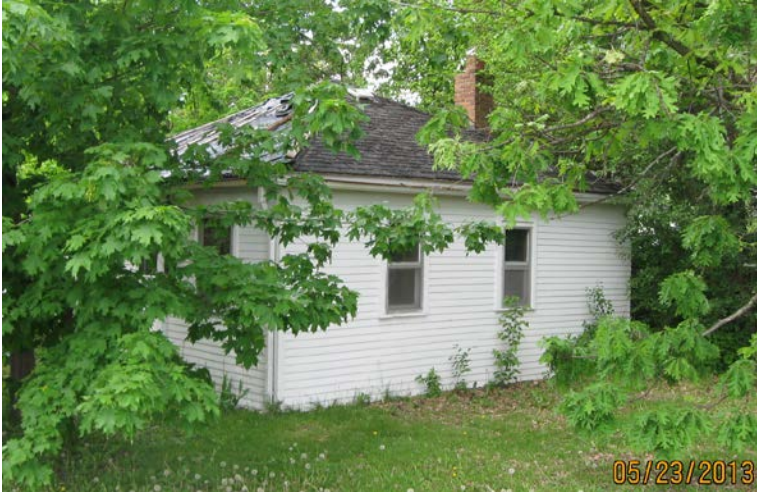
Building Inspection Records