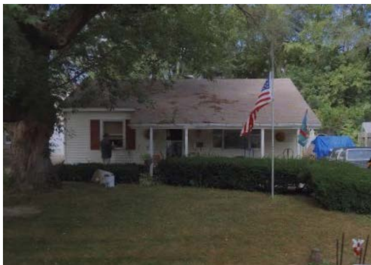
Bing Street View