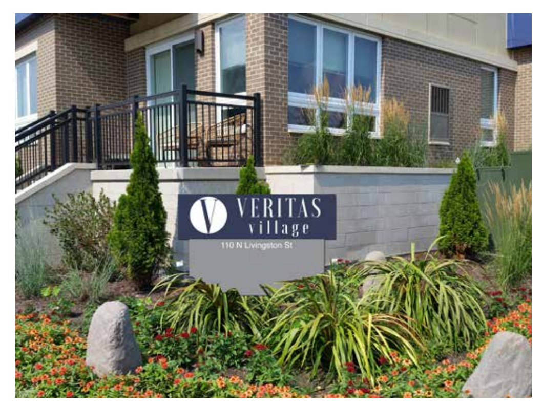
PROPOSED DAY VIEW