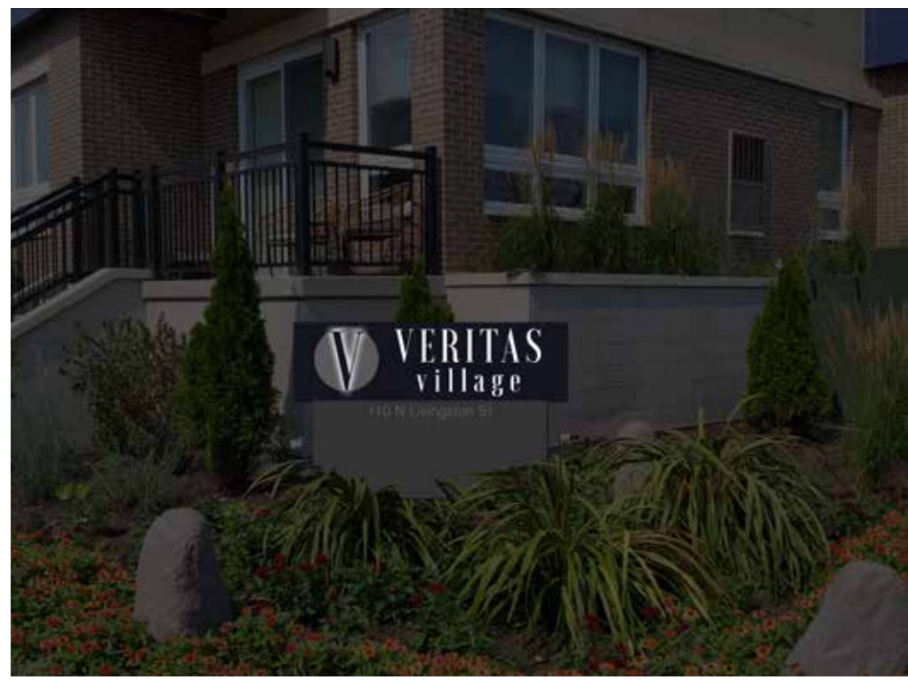
PROPOSED NIGHT VIEW