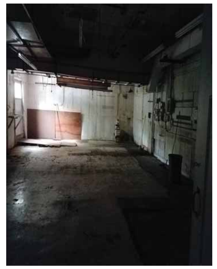
REAR SPACE (EXTERIOR ARCHED ROOF).