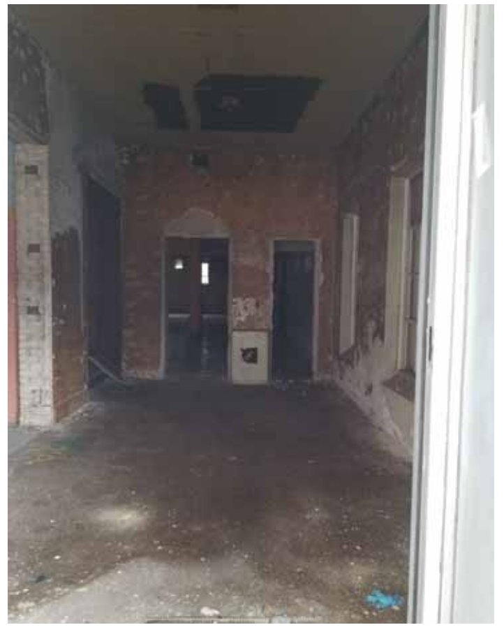
MAIN ENTRANCE SPACE.