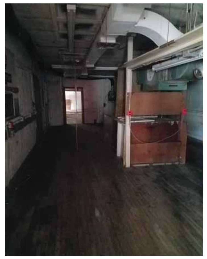
HALLWAY TO REAR SPACE (OPPOSITE BASEMENT STAIRWAY).