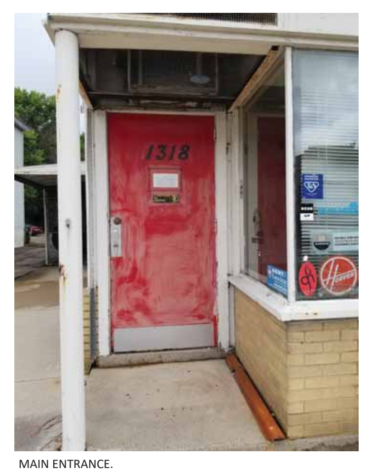
4 | 1318 E WASHINGTON AVE—EXTERIOR