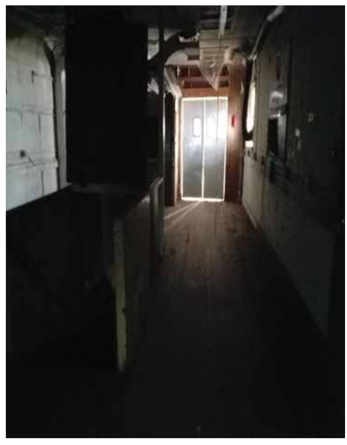
HALLWAY TO BASEMENT STAIRWAY (OPPOSITE REAR SPACE). 6 | 1318 E WASHINGTON AVE— INTERIOR