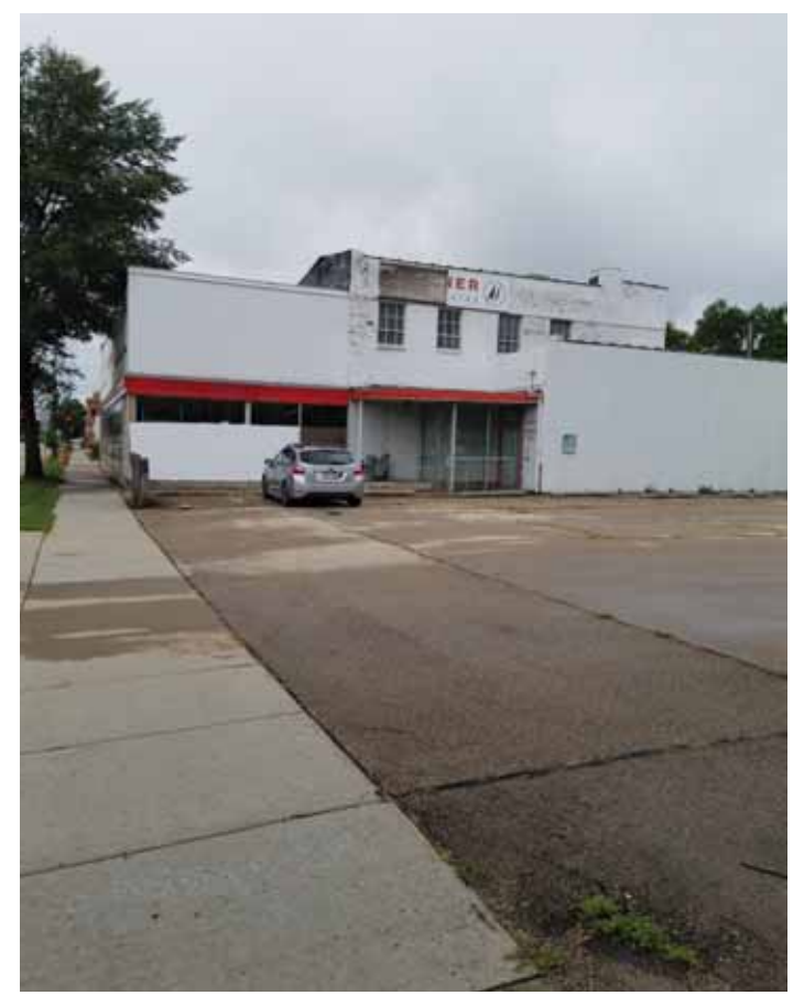
EXTERIOR NORTHEAST #1