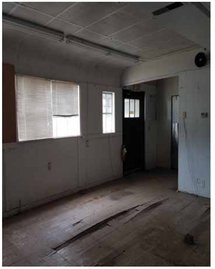
SIDE ENTRANCE (LEFT OF ABOVE DOORWAY).