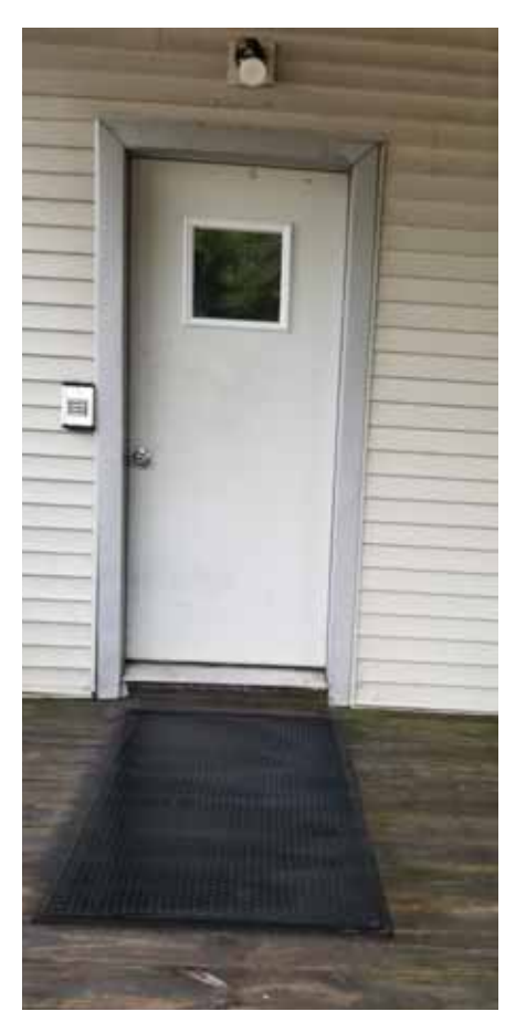
REAR APARTMENT ENTRANCE. 8 | 1314 E WASHINGTON AVE—EXTERIOR