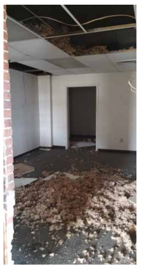
UPPER, ADJACENT TO TOP OF STAIRS.