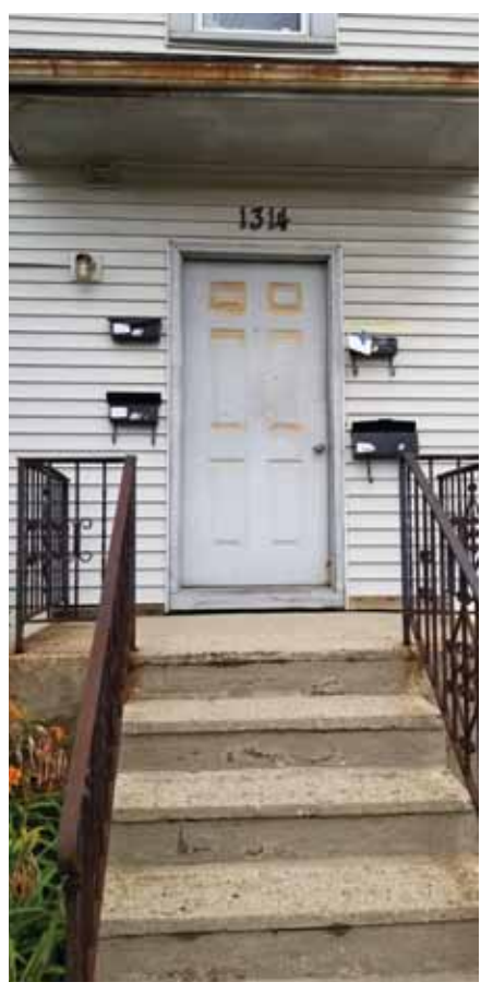
FRONT ENTRANCE, E WASHINGTON AVE.