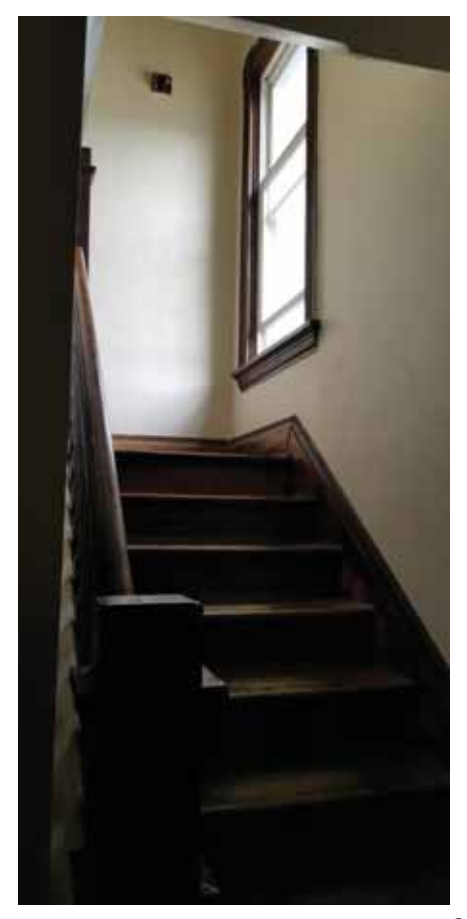
MAIN ENTRY STAIR, ACCESS TO APT #1 & APT #2.