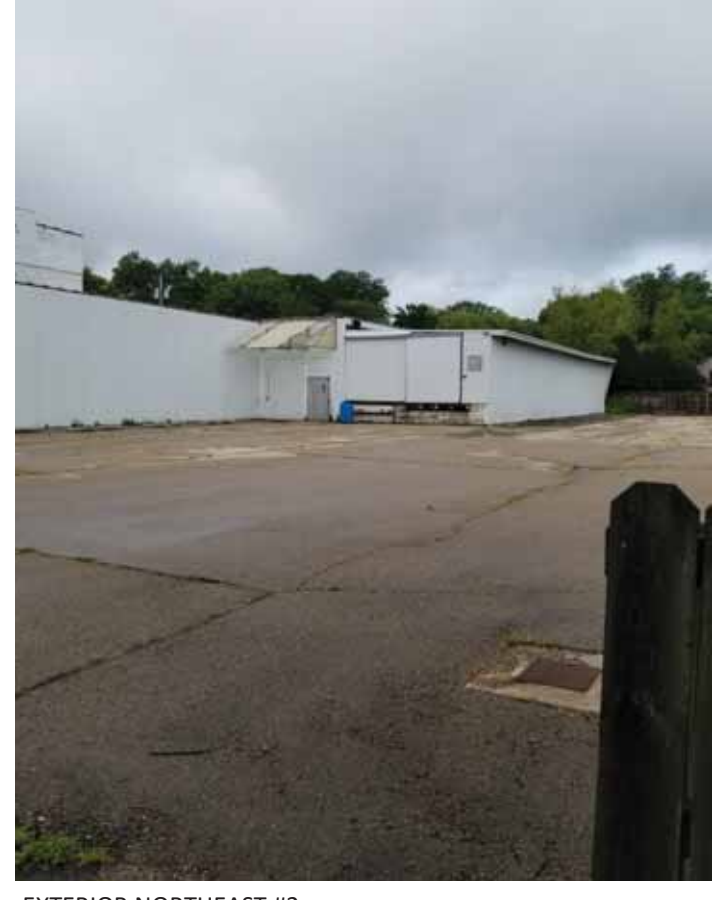
EXTERIOR NORTHEAST #2