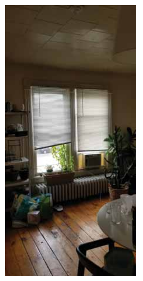
APARTMENT #2 LIVING SPACE.