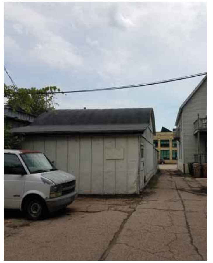
REAR IN RELATION TO APT, FACING E WASHINGTON AVE.