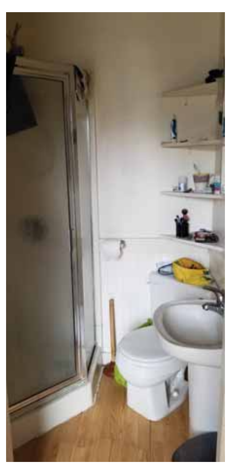
APARTMENT #2 BATHEROOM. 9| 1314 E WASHINGTON AVE—INTERIOR