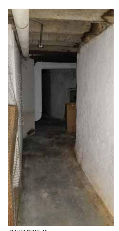
BASEMENT #1. 10 | 1314 E WASHINGTON AVE—INTERIOR