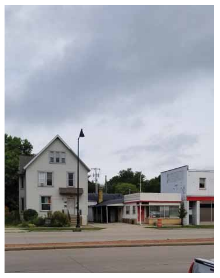
FRONT IN RELATION TO MESSNER, E WASHINGTON AVE.