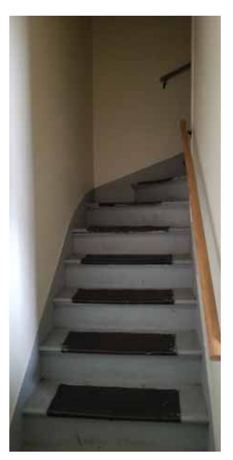
REAR ENTRY STAIR, ACCESS TO APT #3A, 3B & BASEMENT