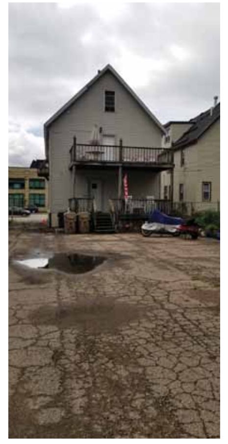
REAR OF APARTMENT.