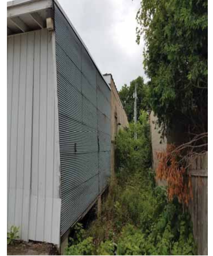
EXTERIOR OF NORTHEAST REAR OF RECEIVING AREA.