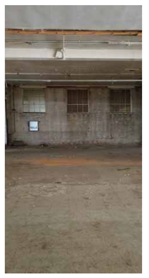
CENTRAL SPACE, MAIN FLOOR.