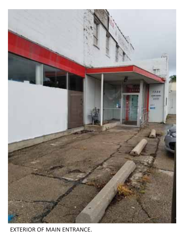
1 | 1326 E WASHINGTON AVE— EXTERIOR