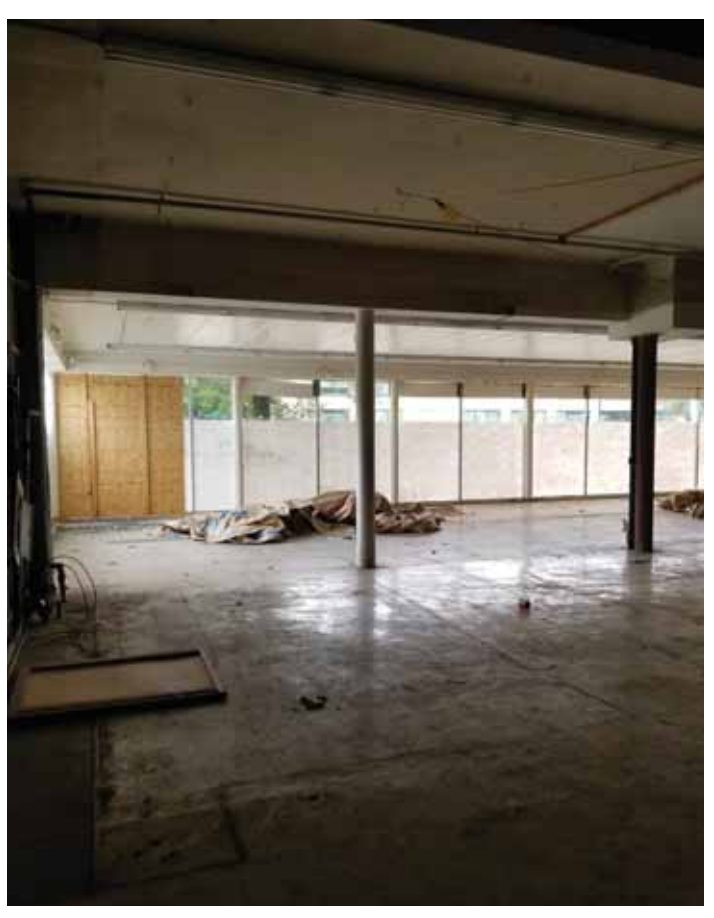
FRONT MAIN SPACE, FACING E WASHINGTON AVE.