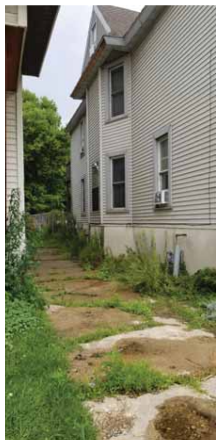
WEST SIDE OF APARTMENT. 7| 1314 E WASHINGTON AVE—EXTERIOR