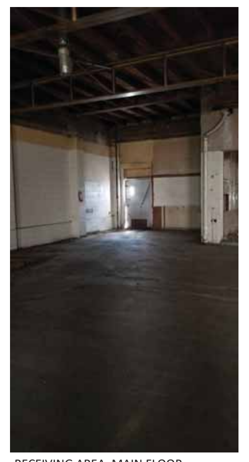
RECEIVING AREA, MAIN FLOOR. 2 | 1326 E WASHINGTON AVE—INTERIOR