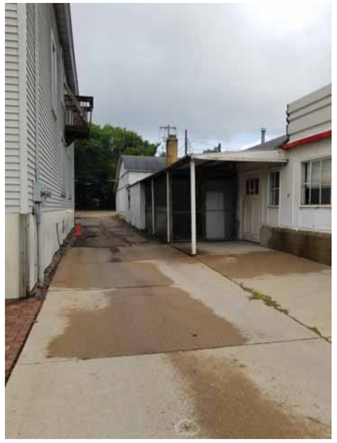
EAST SIDE OF APARTMENT IN RELATION TO MESSNER.