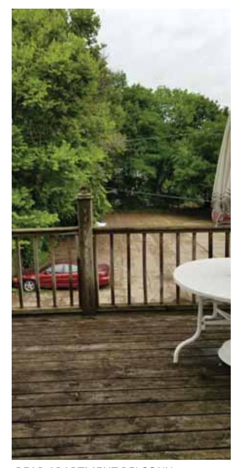
REAR APARTMENT BELCONY.