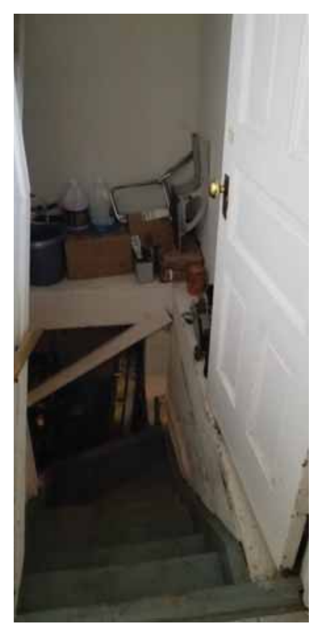
STAIRWAY TO BASEMENT.