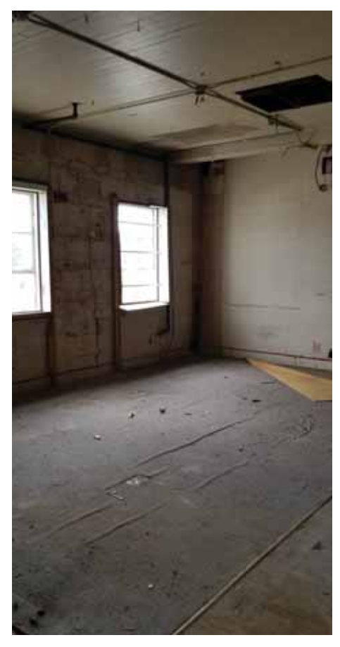
UPPER, TOP OF STAIRS #2.