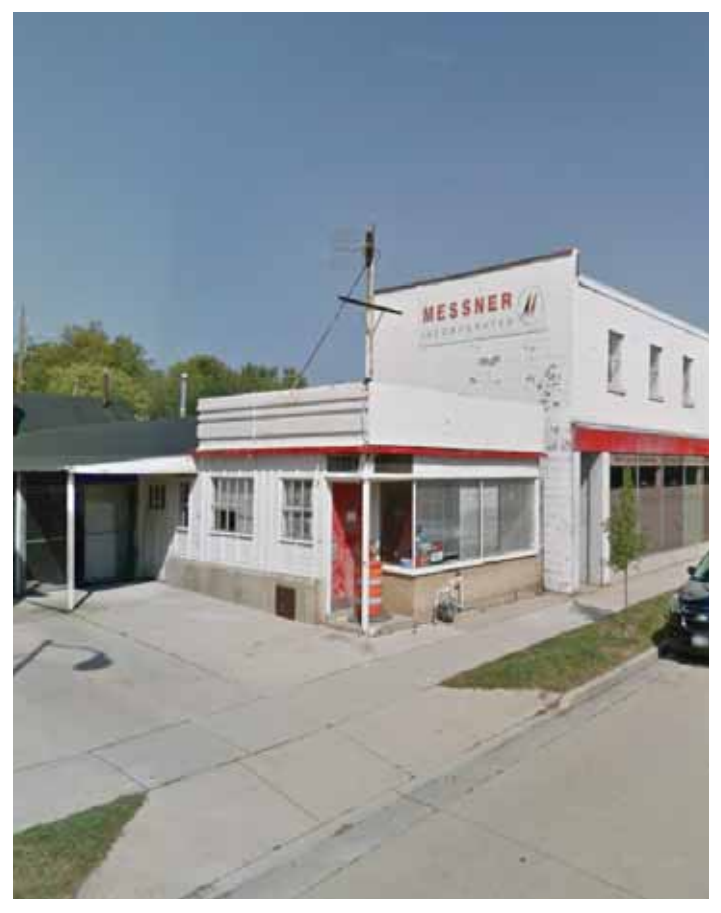
MAIN ENTRANCE IN RELATION TO LARGER MESSNER SPACE.