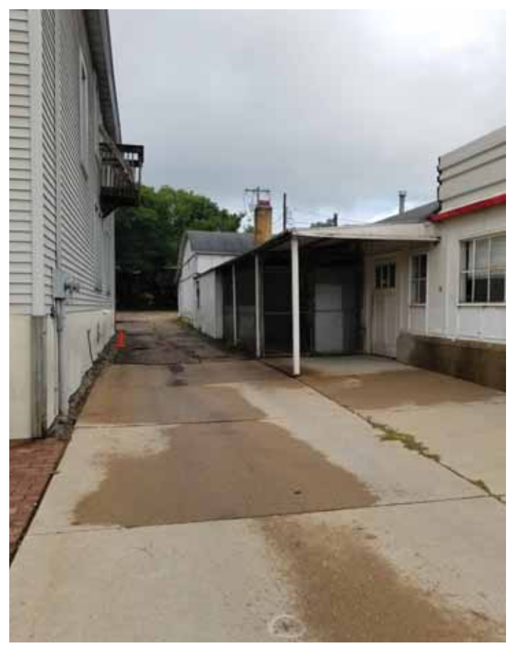
WEST SIDE IN RELATION TO APT.