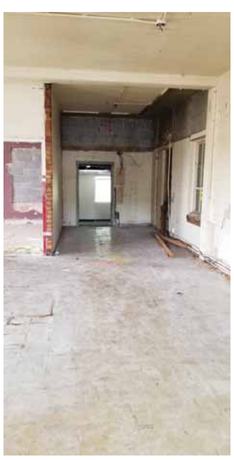
UPPER, TOP OF STAIRS #1. 3| 1326 E WASHINGTON AVE—INTERIOR