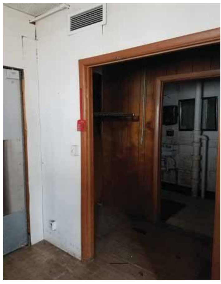
TRANSITIONAL VESTIBULE TO BASEMENT AND REAR SPACES.