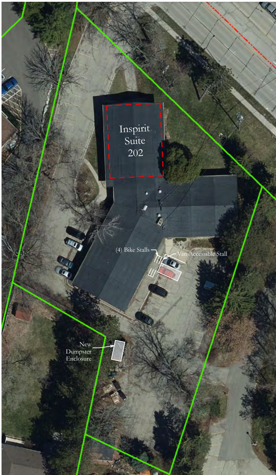
Site Plan @ 1'=40'