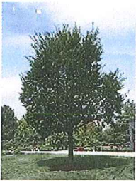
Accolade Elm 50-60'h x 25-40'w Energy savings, wildlife Full sun