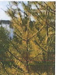
Tamarack 40-80'h x 15-30'w Wildlife, fall color Full sun