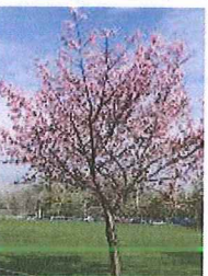
Spring Wonder Cherry 20-25'h x 20'w Ornamental, showy Full sun