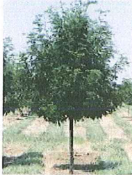
Skyline Honeylocust 45'h x 35'w Energy savings, adaptable Full sun to part shade