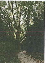
London Planetree 50'h x 40'w Shade, ornamental Full sun