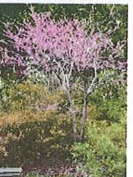
Red bud 20-30'h x 20'w Showy, shade tolerant Full sun to partial shade