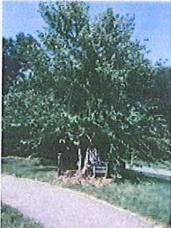
River Birch 50'h x 40' w Energy savings, conservation Full sun to part shade