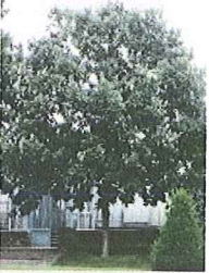
Swamp White Oak 60'h x 60'w Energy Savings, wildlife Full sun