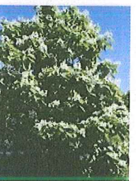
Catalpa 40-60'h x 20-40'w Showy, shade Full sun to partial shade