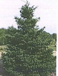
Black Hills Spruce 30-40'h x 20-30'w Energy savings, wildlife Full sun