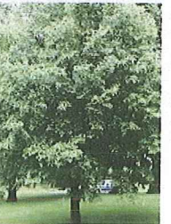
Ironwood 30'h x 25'w Showy, shade tolerant Full sun to partial shade