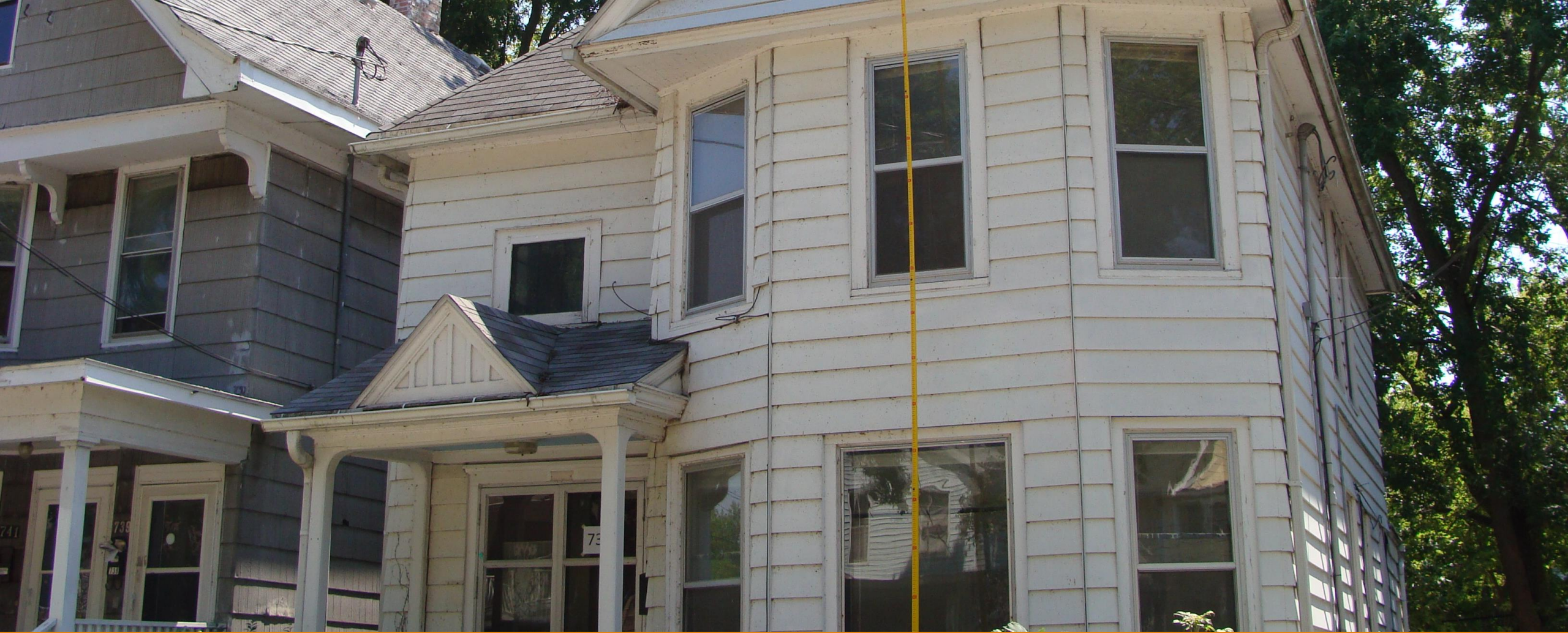
House #2 : 737 E Johnson