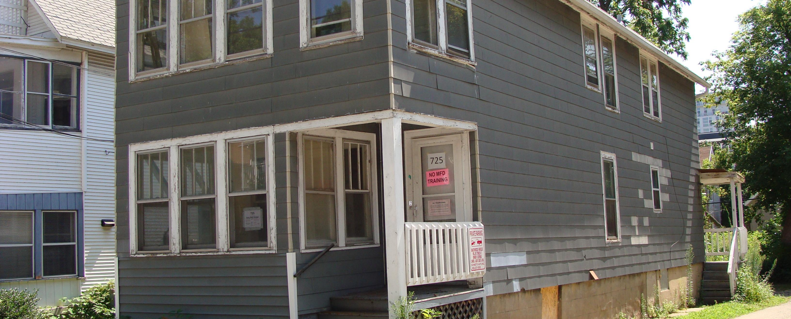
House #1 : 725 E Johnson