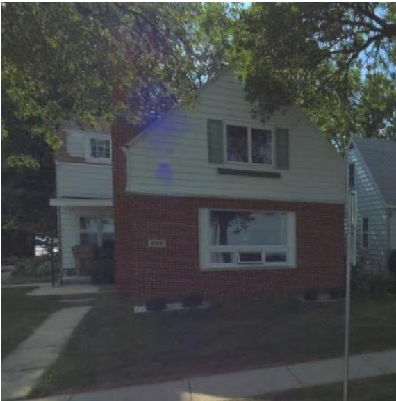
Bing Street View