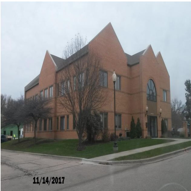
City Assessor's Office

Commercial building constructed in 1990.