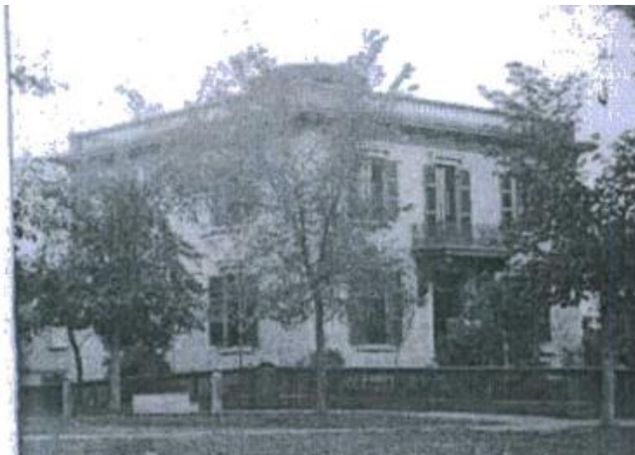
c. 1868, WHi31861

The work was constructed differently than approved. The piers were constructed in brick instead of wood and the brick was not in a color that was appropriate for the landmark building. The two middle piers flanking the front steps were constructed wider and taller than the other piers. In addition, the middle piers have been installed with conduit and wiring to receive a top mounted light fixture. Staff worked with the property owner's representative to find an agreeable solution to allow the brick piers to remain. The brick has been stained to closely match the color of the stone. In their current configuration, the piers are very similar to those shown in the photo from the 1970s except that the middle piers and the pier on the east corner are wider and taller than the other piers. There is ghost evidence on the building wall of an engaged pier on the east side of the porch.