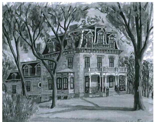
Illustration with Mansard roof, WHi29733