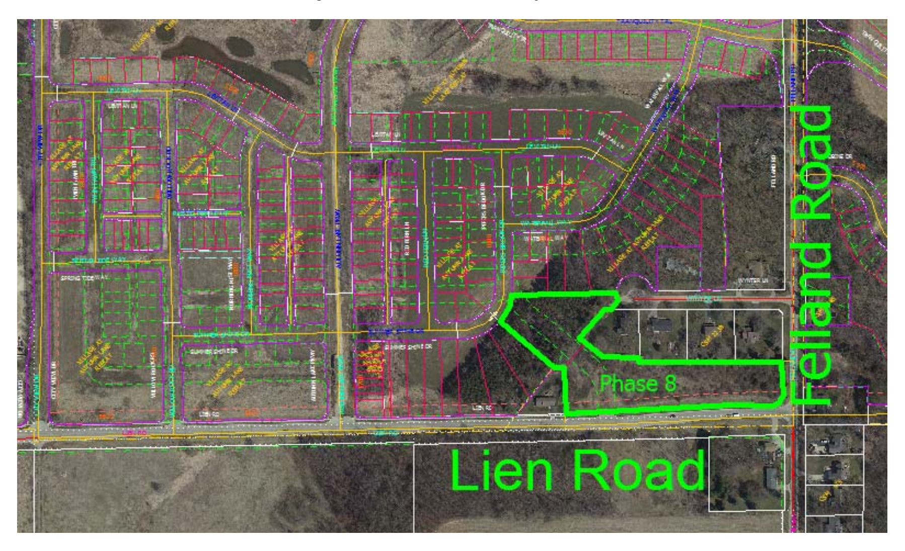
Village at Autumn Lake – Phase 8, Project Location