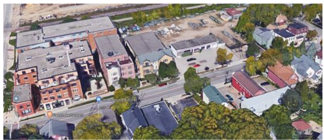
Google Maps, 2018