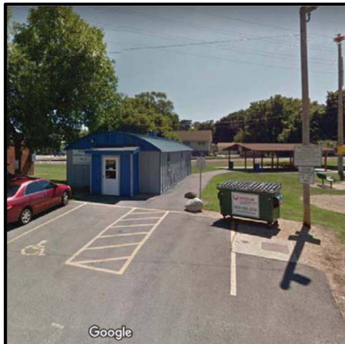
Image of Quonset Hut