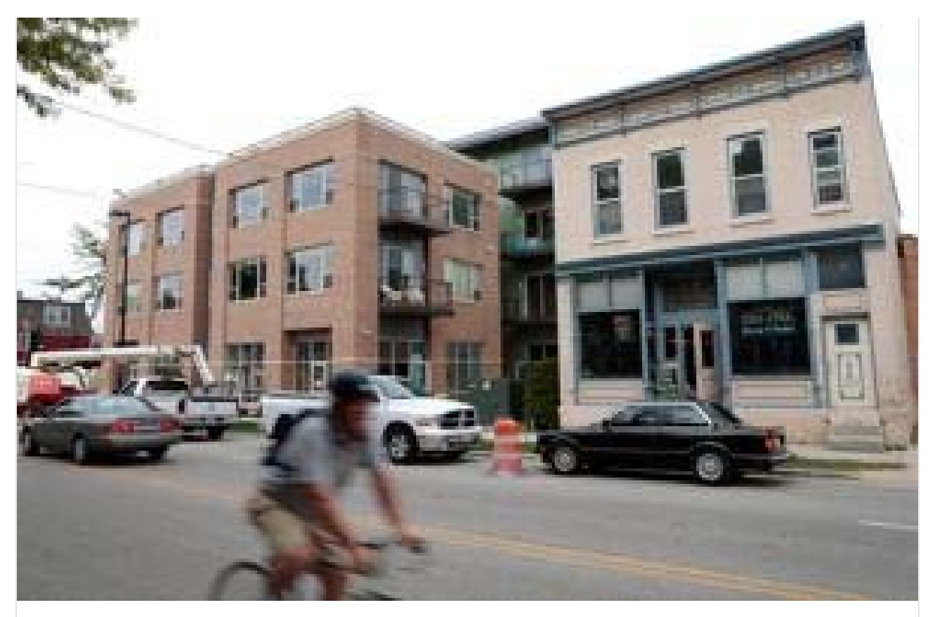
Popular Marquette neighborhood offers festivals, eclectic Willy Street vibe