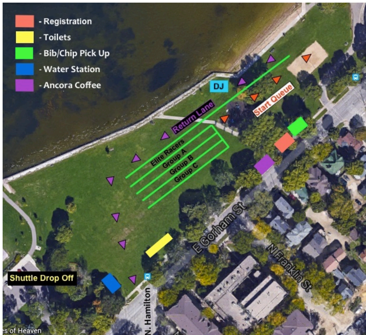
6.16 Isthmus Paddle & Portage – site map James Madison