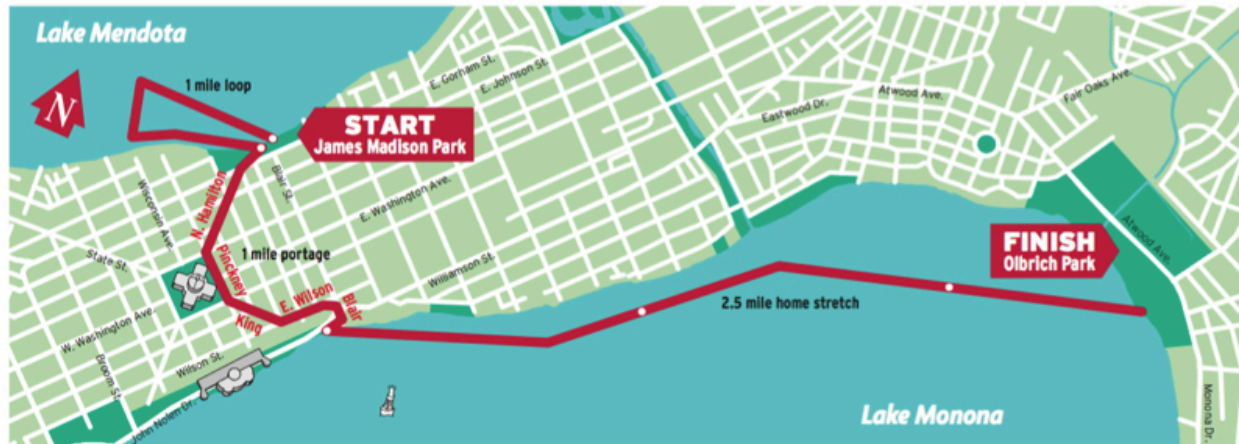
6.16 Isthmus Paddle & Portage – route map