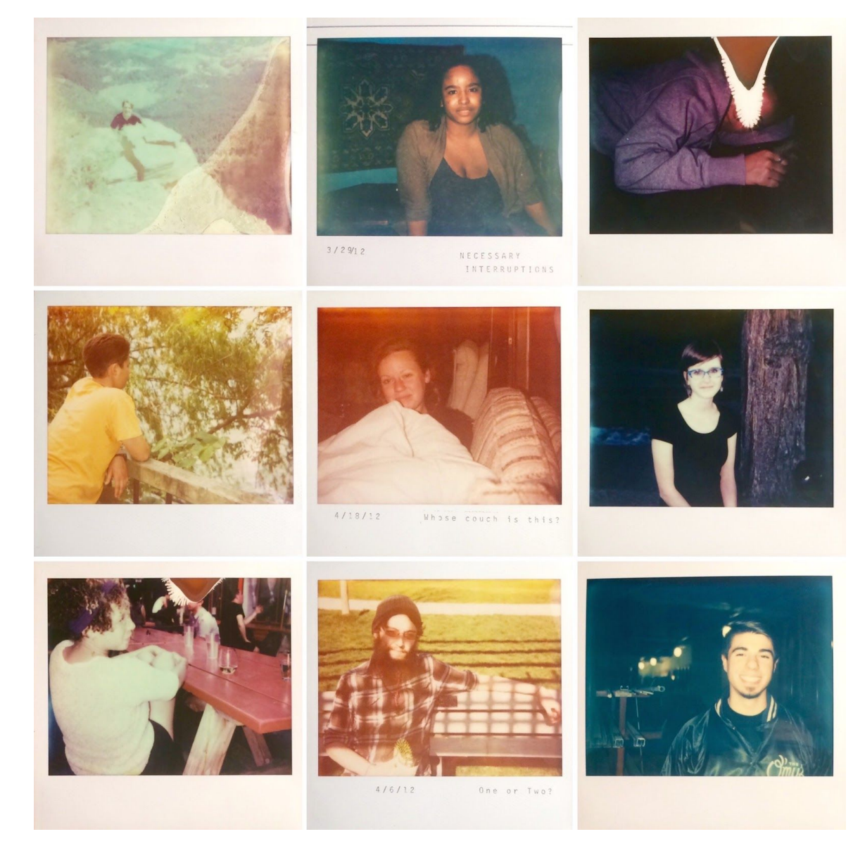
Index (in progress) Book of interviews represented in instant film and type 2011-present

Index is a collection of conversational encounters documented incompletely through instant film and a few words; this project is curious about how we might measure intimacy, leveraging the fragility of memory to understand how time, environment, and willful decision-making impacts emotion, human connection, and sense of self. This project is closely linked to Season of Shadows as a conversational piece.