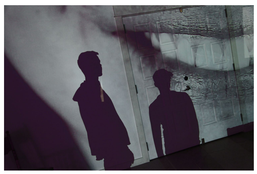
Toast: an exhibition by Alaura and you (details, Vimeo link provided in application) Multi-channel video installation, performance, and participatory project 2016

Toast, a socially engaged "not so solo" exhibition on view at the Arts + Literature Laboratory from April 1 through April 23, 2016, was an installation and video-based work reconciling the tension between private confrontations and public spectacles, contemplating both what people do spontaneously what and people perform consciously. The exhibition. screened in its final form, was born of a lifetime of intimate encounters and one night of filmina with community members. Along with peers and strangers, I was negotiating with memories while investigating accountability for social dilemmas. celebrating aueer identity and cleansing the palate. I sat in the gallery throughout the exhibition as a stealth performance, discussing topics like pronouns, sexuality, religion, class, militarism, and coffee with guest-participants.