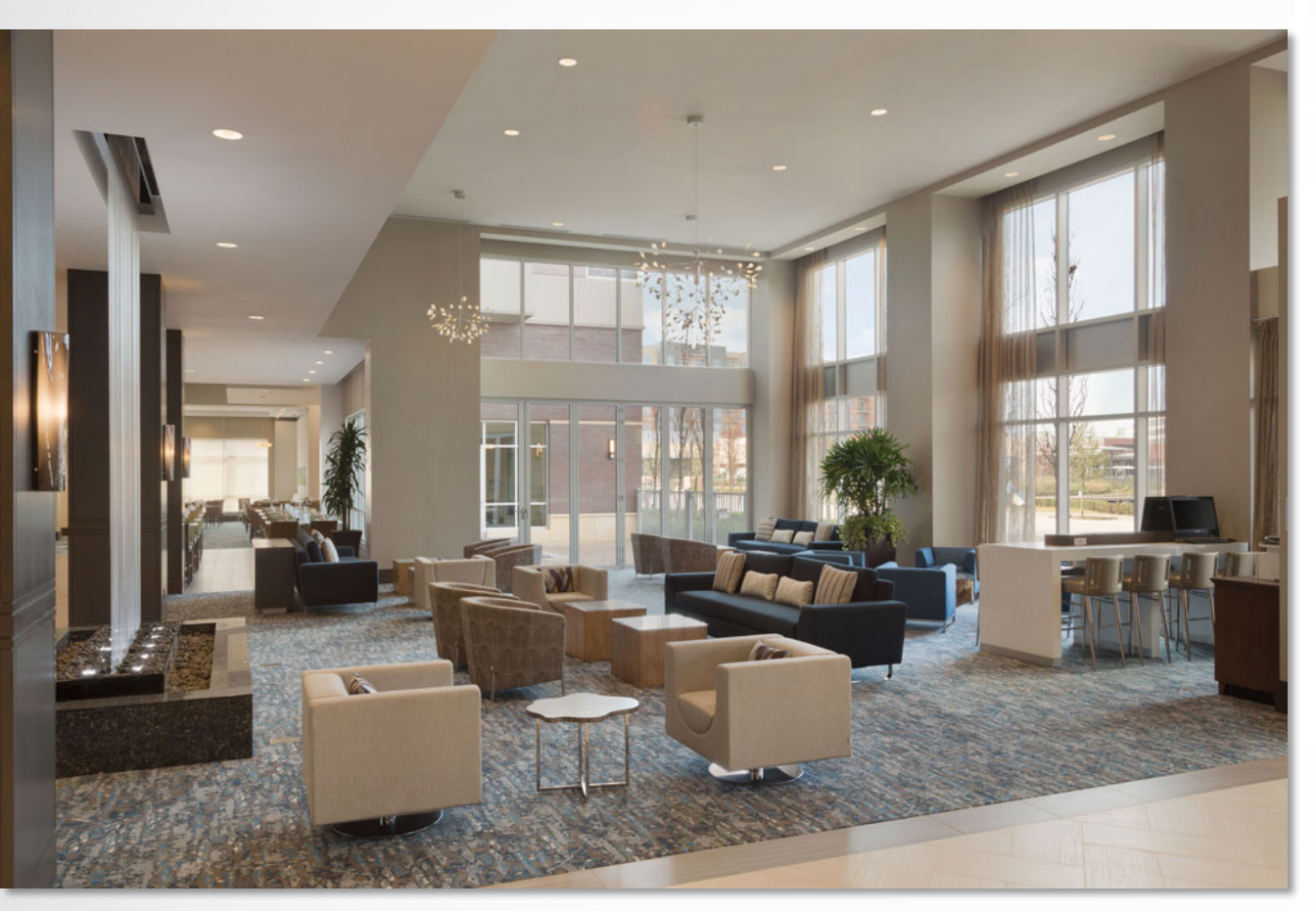
Embassy Suites by Hilton The Woodlands at Hughes Landing