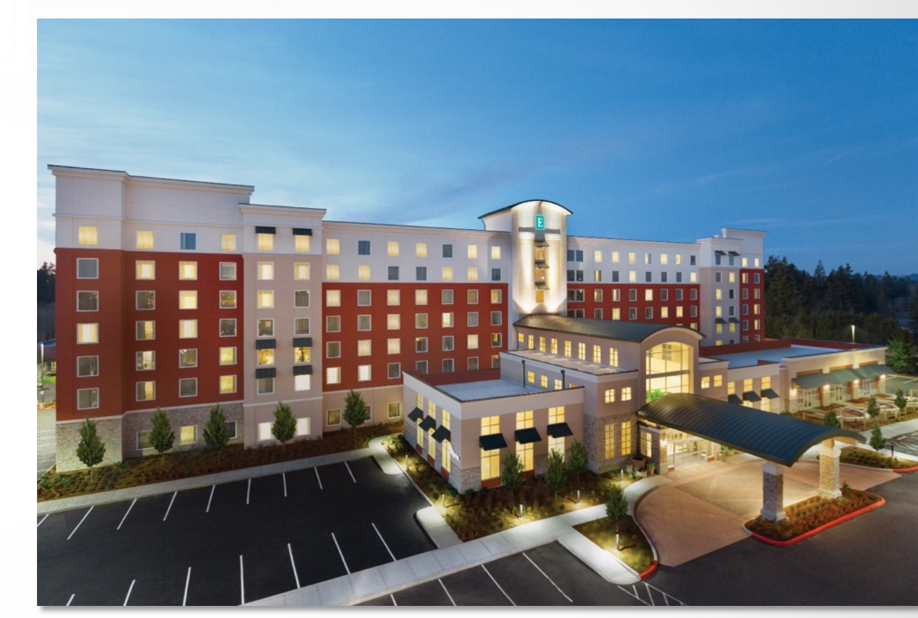
Portland Hillsboro, OR