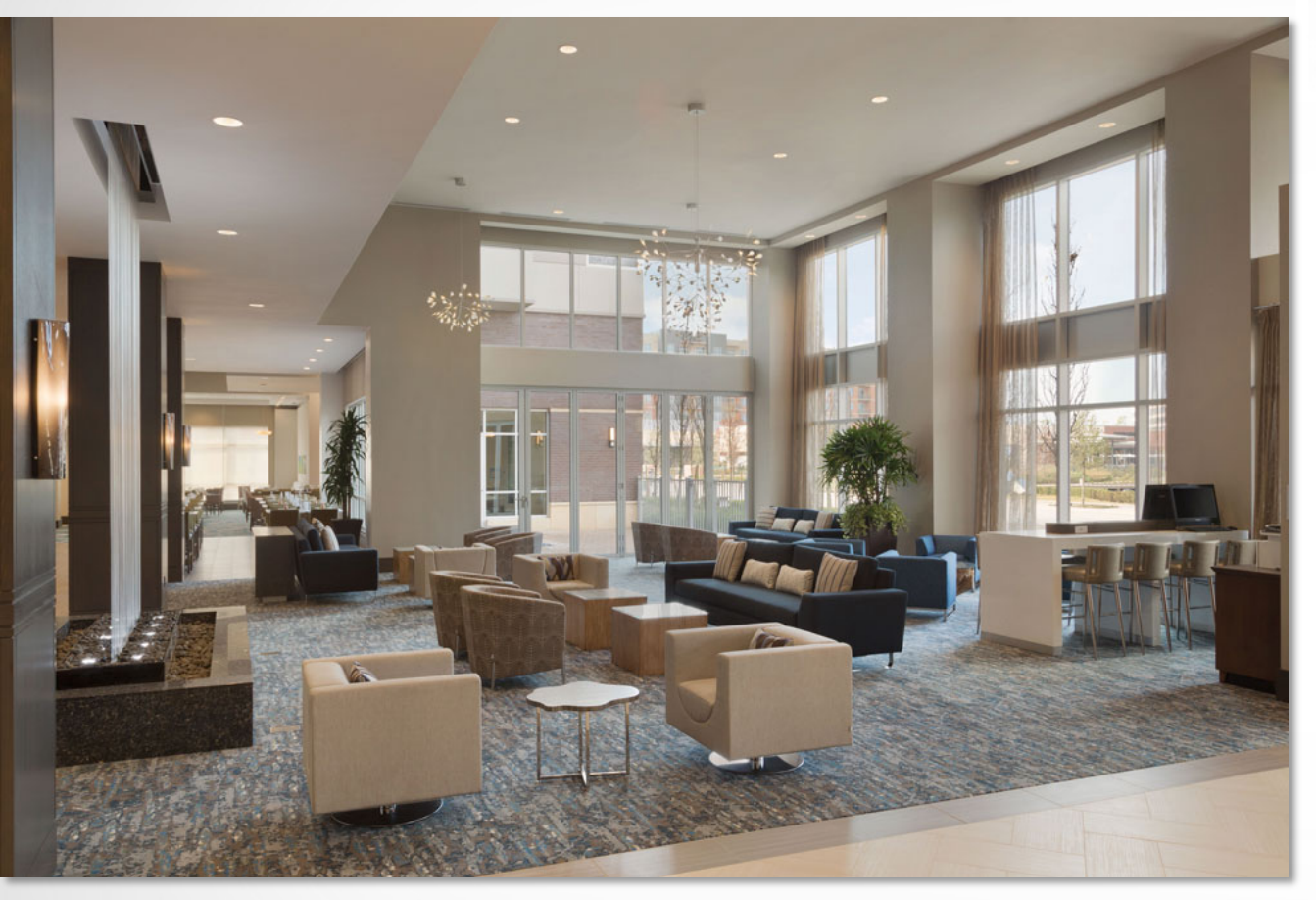
Embassy Suites by Hilton The Woodlands at Hughes Landing