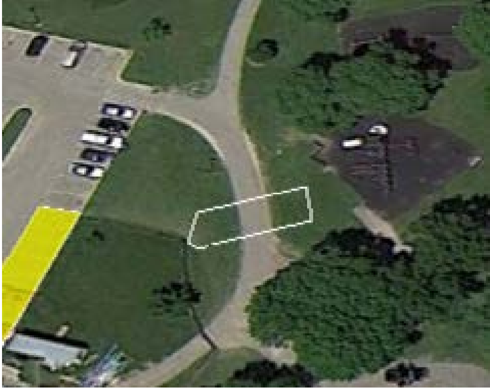
Start/Finish Inflatable Arch for Madison Winter Festival 2018 )