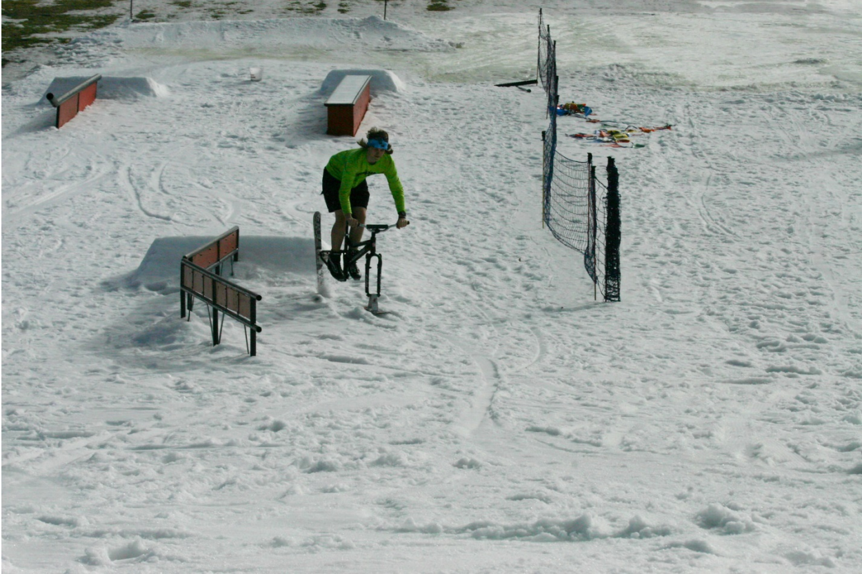
Elver Terrain Park – Madison Winter Festival 2018