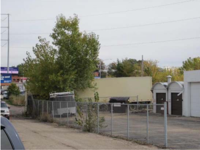
City Assessor's Office

Commercial building, construction date unknown.