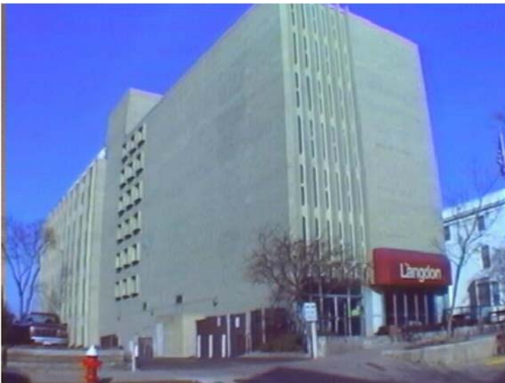
City Assessor's Office

Apartment building with 192 units constructed in 1963.