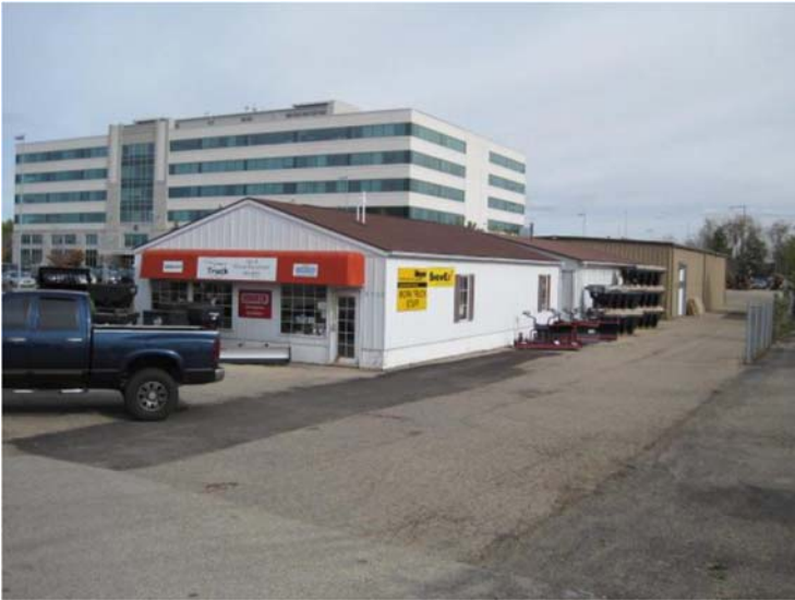
City Assessor's Office

Three commercial buildings constructed in 1950, 1960, and 1992.