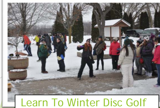
Learn To Winter Disc Golf