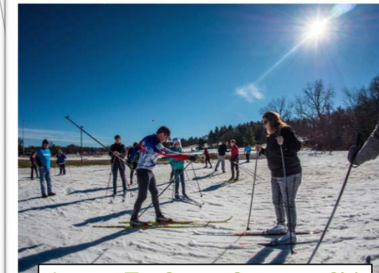
Learn To Cross Country Ski