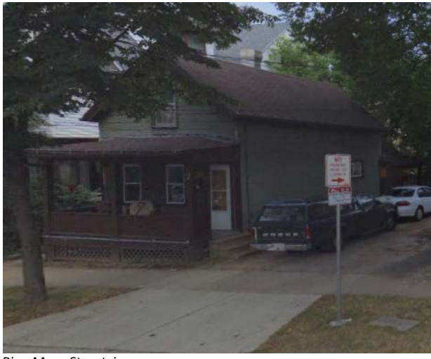
Bing Maps Streetview