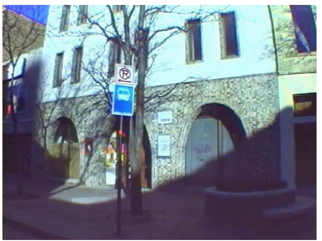
City Assessor's Office – 122 State