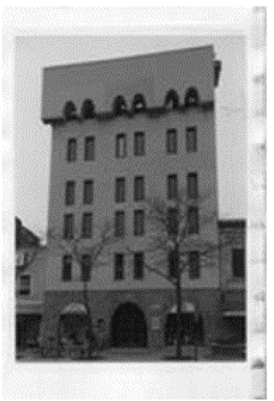
WHS Property Record