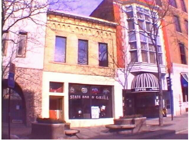
City Assessor's Office – 118 State

Commercial buildings constructed in 1886 and 1917, respectively.