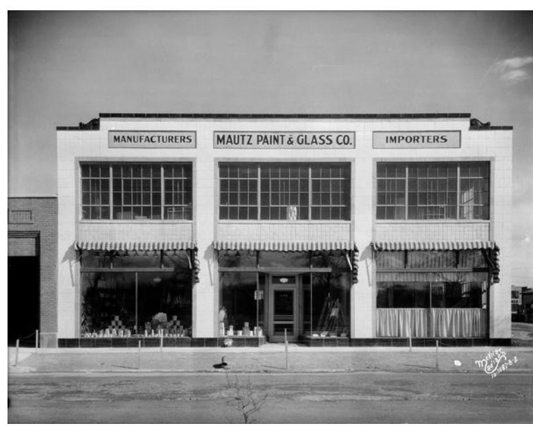
Mautz Paint & Glass Company building located at 939 East Washington Avenue, Wisconsin Historical Society

The preservation file for 927-939 East Washington notes that Mautz paint built this building in 1928 for their use as a varnish plant. In the late 1920s and 1930s the firm was the only factory specializing in paint products for professional contractors. This site became the base of operations for their paint manufacturing business. By 1939 the firm had over 50,000 square feet of factory spaces on this site, employed nearly 100 people with an annual payroll of about $600,000. 15 sales representatives oversaw the distribution of Mautz products in Wisconsin, Iowa, Minnesota, Michigan, Illinois and Indiana. The firm also operated a testing laboratory and the largest decoration studio in Wisconsin. Another note in the file notes that Mautz is the only paint manufacturing firm in Madison during the historic period.