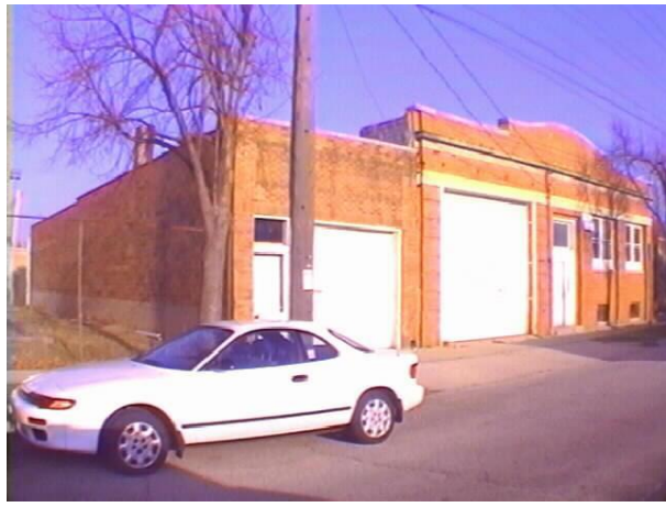
City Assessor's Office – 924 E Main

Commercial buildings constructed circa 1929