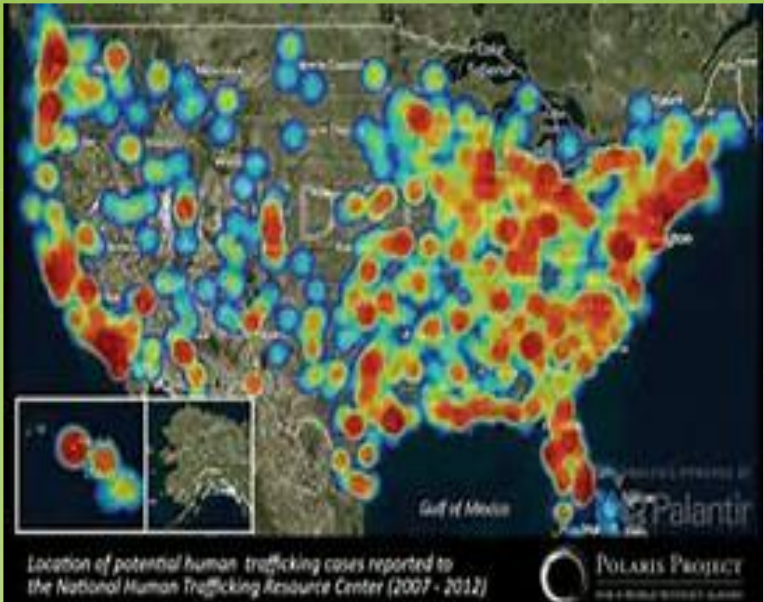
Location of potential human trafficking cases reported to the National Human Trafficking Resource Center (2007 - 2012)