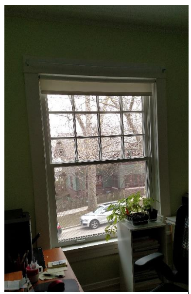
New window southwest bedroom