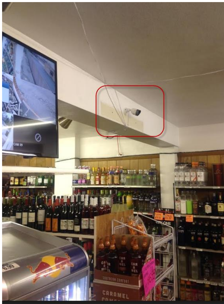
Figure 2 Camera facing the main entrance