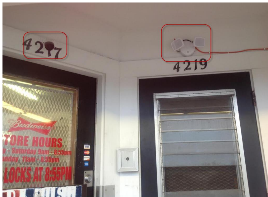
Figure 4 camera outside main entrance