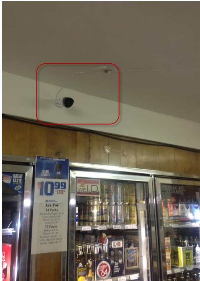
Figure 3 Camera on the back wall