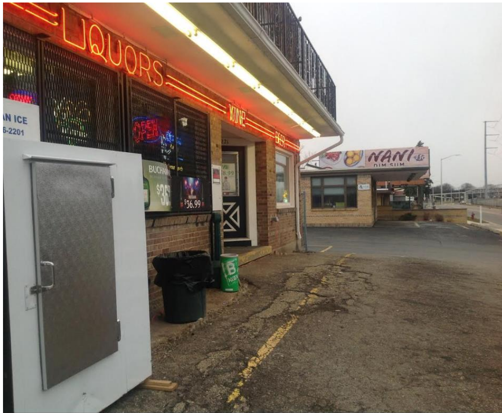
Figure 7 Front of the store clear of garbage