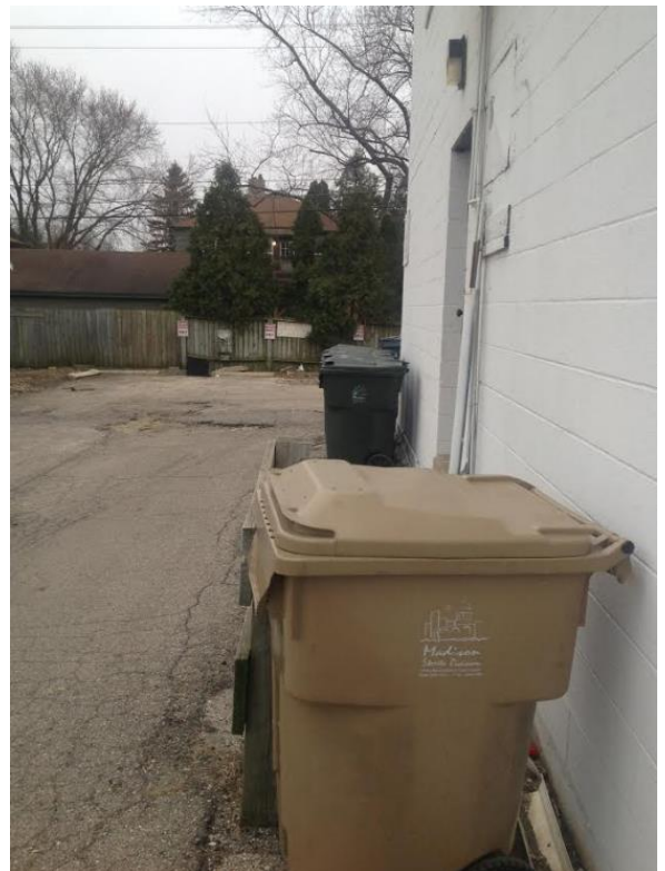
Figure 6 Trash Pickup date, most of the trash bins were out on the curb