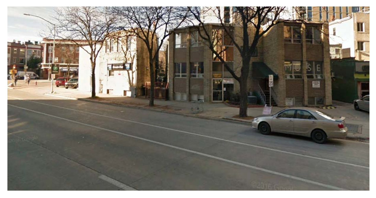
Potential new bus stop on University Avenue near side Gilman Street