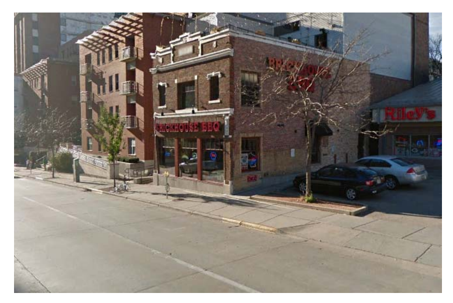
Potential new bus stop on Gorham Street far side Broom Street