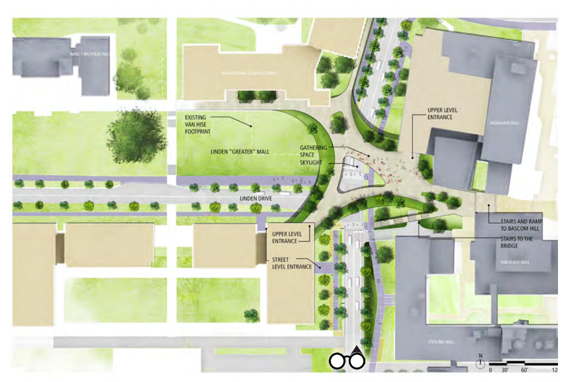
N. Charter Street and Linden Drive pedestrian bridge and landscape redevelopment. Eye-level illustration top of next page.

Vehicle parking will become more compact – most surface parking lots will be converted to above-ground or underground parking structures. Parking structures will reduce our environmental impact with incorporated renewable energy generating roofs and green roofs for stormwater management.