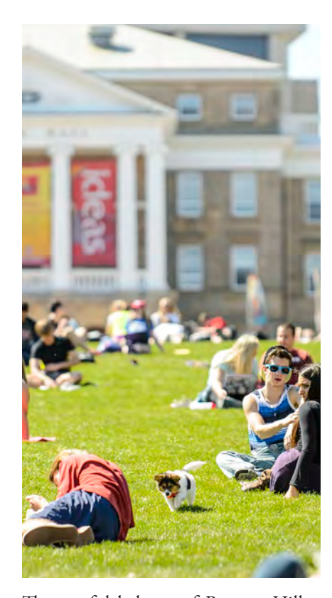
The careful balance of Bascom Hill – mixed-use buildings of architectural prominence surrounding and defining a well-designed and active open space.

The 2015 Campus Master Plan Update vision is to capture the best characteristics of our historic campus core, and extend and strengthen them throughout our evolving campus.