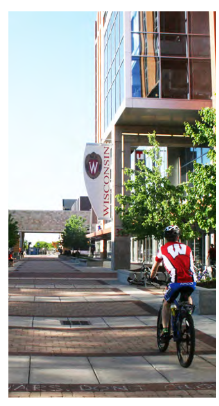
The comfort and safety of Library Mall and East Campus Mall – easy walking and biking with careful interaction with vehicles.