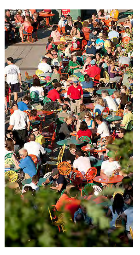
The activity of the Memorial Union Terrace – indoor and outdoor places for people to gather and exchange ideas with a focus on Lake Mendota.