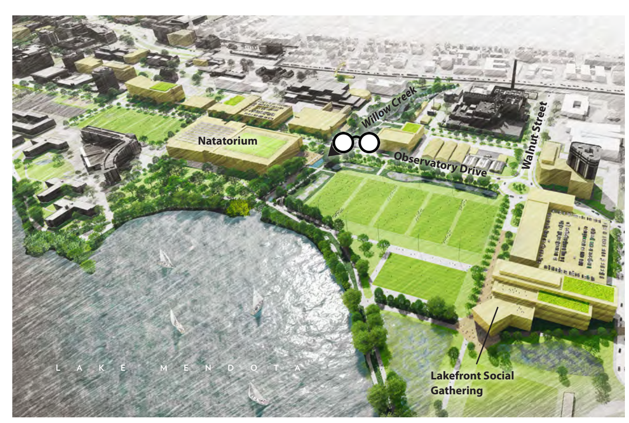
Willow Creek will become an attractive and engaging backbone for the stormwater management system in the near west agricultural and life science campus. Eye-level illustration top of next page.

Both the near west agricultural campus and the west health sciences campus have turned their backs on Willow Creek, an urban creek that is the only tributary on Lake Mendota on campus. This district of campus is poised for significant redevelopment, bringing an incredible opportunity to create a new campus vernacular of working landscapes and a revitalized creek, rooted in the agricultural and natural history of the area.