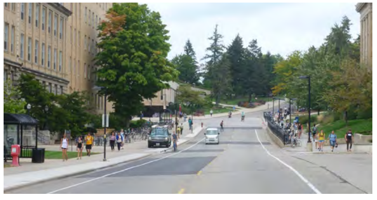
N. Charter Street (Existing) – Looking north toward Linden Drive

Perhaps the most difficult transportation challenge is the N. Charter Street and Linden Drive intersection, which has pedestrian volumes during class changes rivaling Midtown Manhattan intersections. The 2015 Campus Master Plan Update recommends a dramatic grade-separated pedestrian bridge. The bridge will flow with the existing topography, directly connecting pedestrian destinations east to west and serving as an extension of the landscape along Linden Drive.