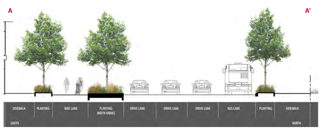
University Avenue (Proposed) - Cross-section (A-A')

The 2015 Campus Master Plan Update envisions a new University Avenue. Combining bike lanes into a separated two-way lane makes cycling more comfortable and safe for many users, and completes a regional off-street path. The transit lane and streetscape on the north will welcome the introduction of bus rapid transit service. The addition of landscaping within and at the edges will improve the appearance of our most visible transportation corridor. We understand University Avenue's role in the region, so these changes will not reduce its vehicular capacity.