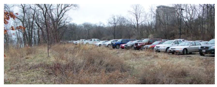
Lot 34 now dedicates the foot of Observatory Hill to surface parking.