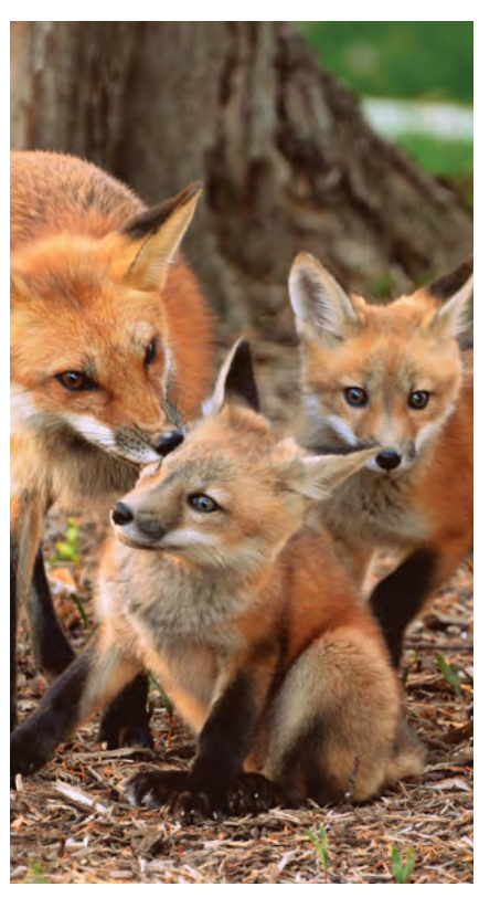
The preservation of the Lakeshore Nature Preserve – a place of respite for humans and habitat for flora and fauna.