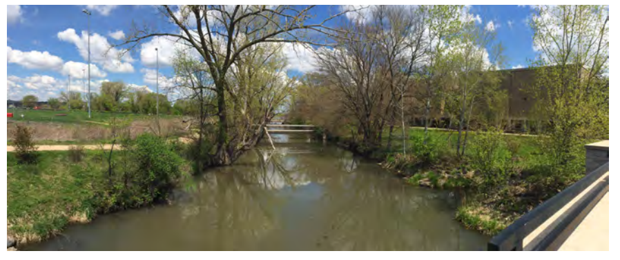
Willow Creek (Existing) - View looking north from Observatory Drive bridge.

The Willow Creek riparian zone should be restored by expanding the vegetative buffer to manage non-point source pollution. The removal of Easterday Lane will provide much needed green space for rain gardens to manage stormwater, cleansing and slowly releasing it to Willow Creek. Perched wetlands along the west side of the creek will intercept stormwater runoff from the Physical Plant Grounds Department service yard prior to it entering Willow Creek. Interpretive signage along boardwalks will educate students and visitors to the university's cutting-edge stormwater management research.