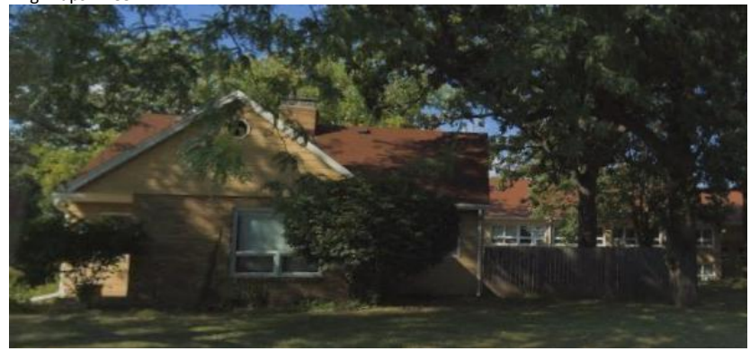
Bing Maps - 3922