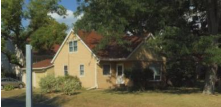
Bing Maps --- 3922

Two single-family homes, constructed circa 1955