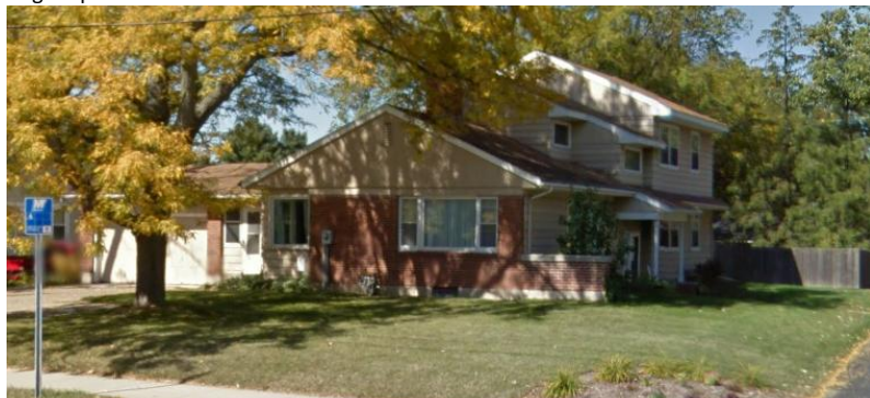
Google Street View --- 3926