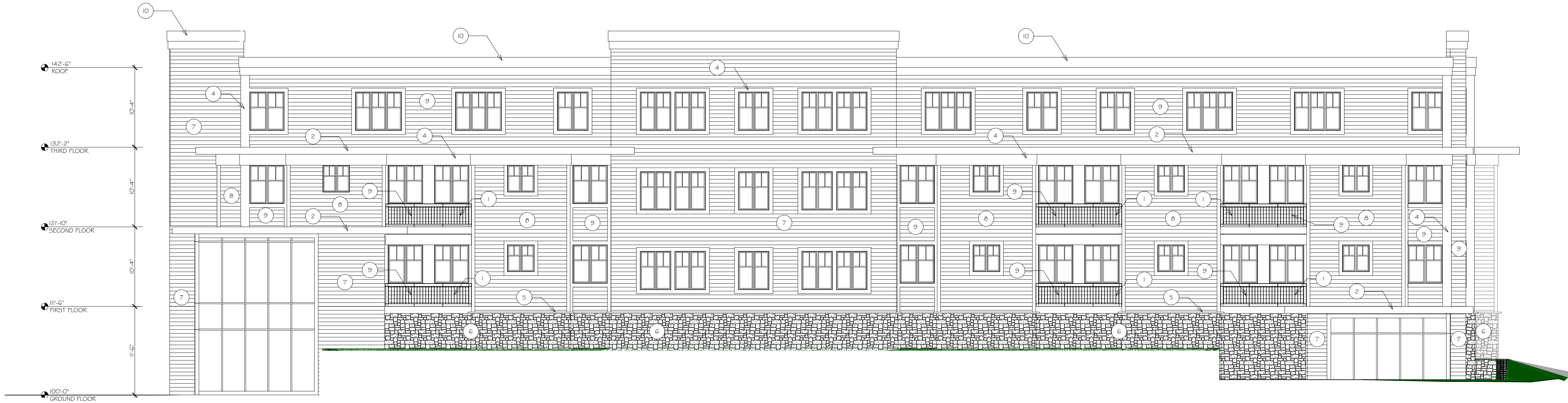
ELEVATION "A" (NORTH)