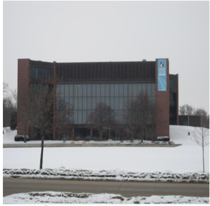
City Assessor's Office

Commercial Building constructed in 1970. Former Madison College West Campus (vacant).