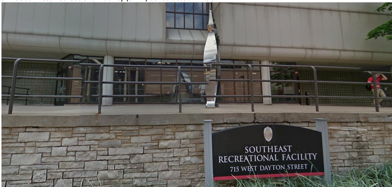
Google street view

UW Southwest Recreational Facility (SERF) constructed in 1982.