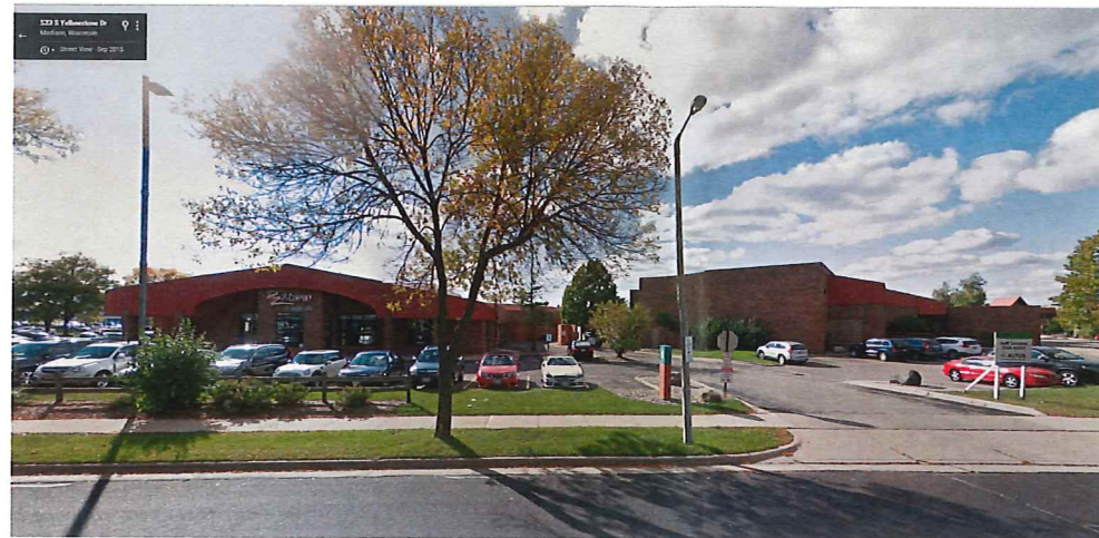
VIEW TO WEST FROM YELLOWSTONE