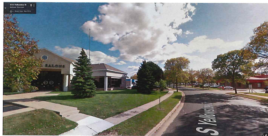
VIEW TO EAST FROM AT NORMANDY LN