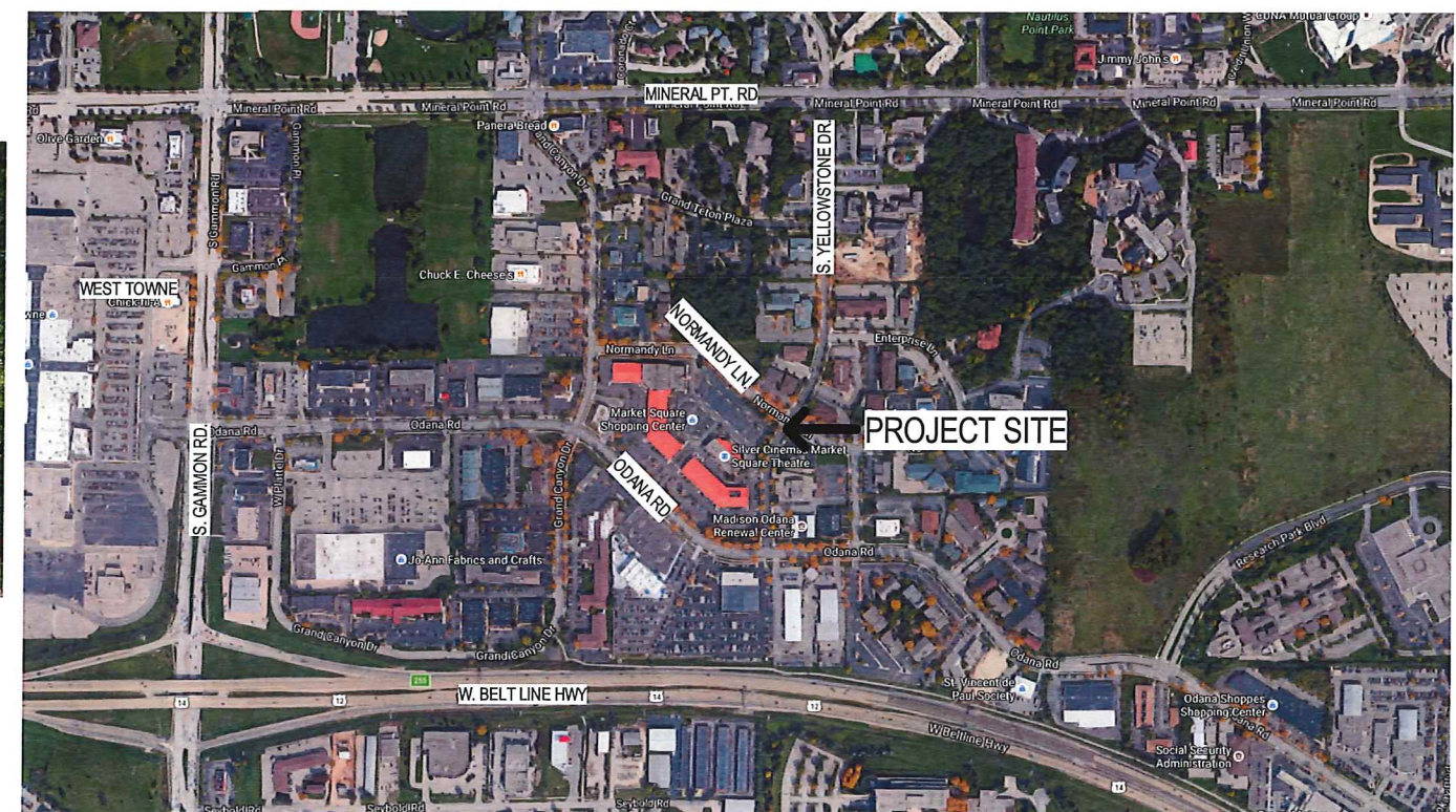
LOCATOR MAP - NTS