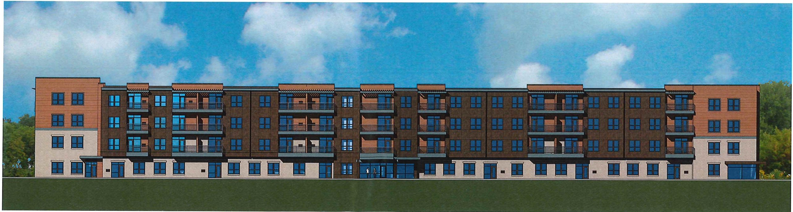
② South Elevation 1/8" = 1'-0"