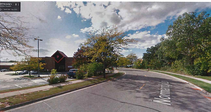
VIEW TO WEST AT NORMANDY LN