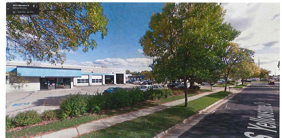
VIEW TO EAST FROM YELLOWSTONE