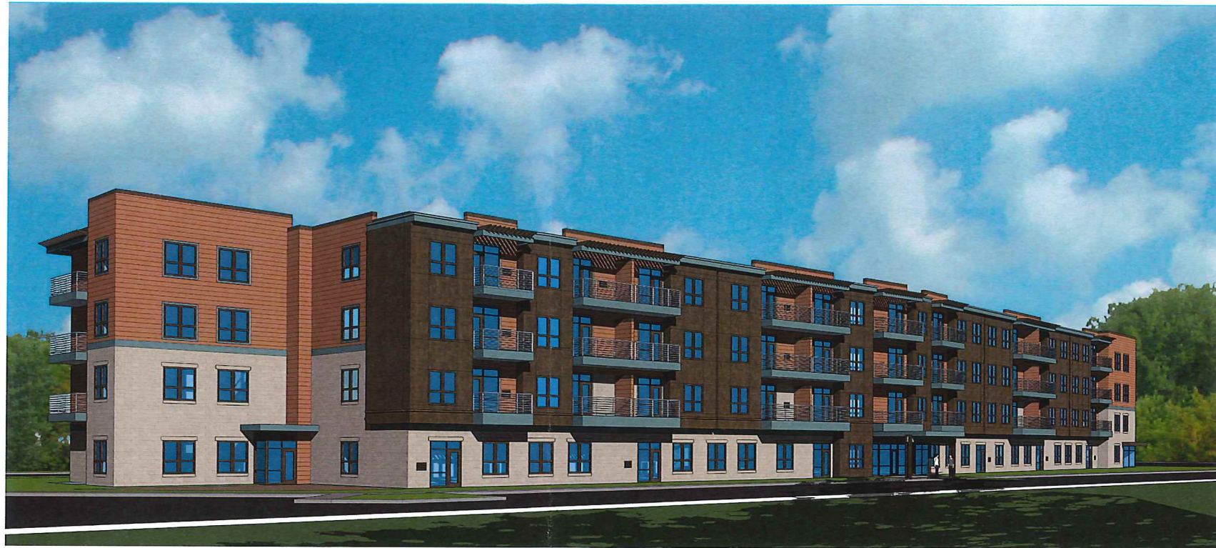
① 3D View to NE 1" = 1'-0"