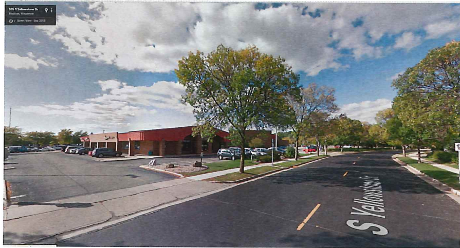
VIEW TO NORTH ON YELLOWSTONE FROM GAMMON