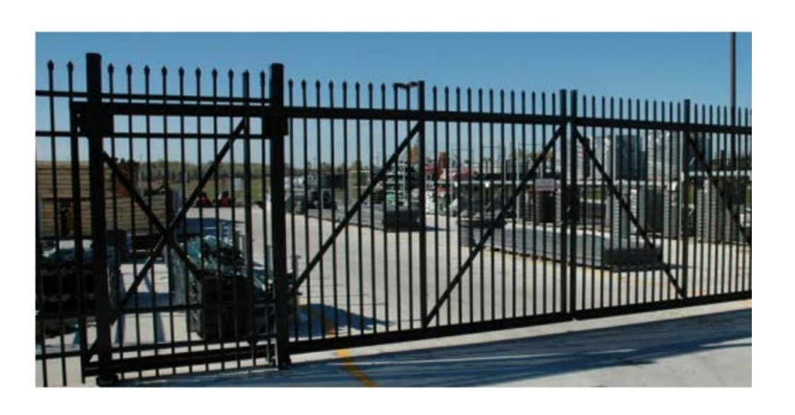
Proposed fencing along Nakoosa Trail – Ameristar fencing