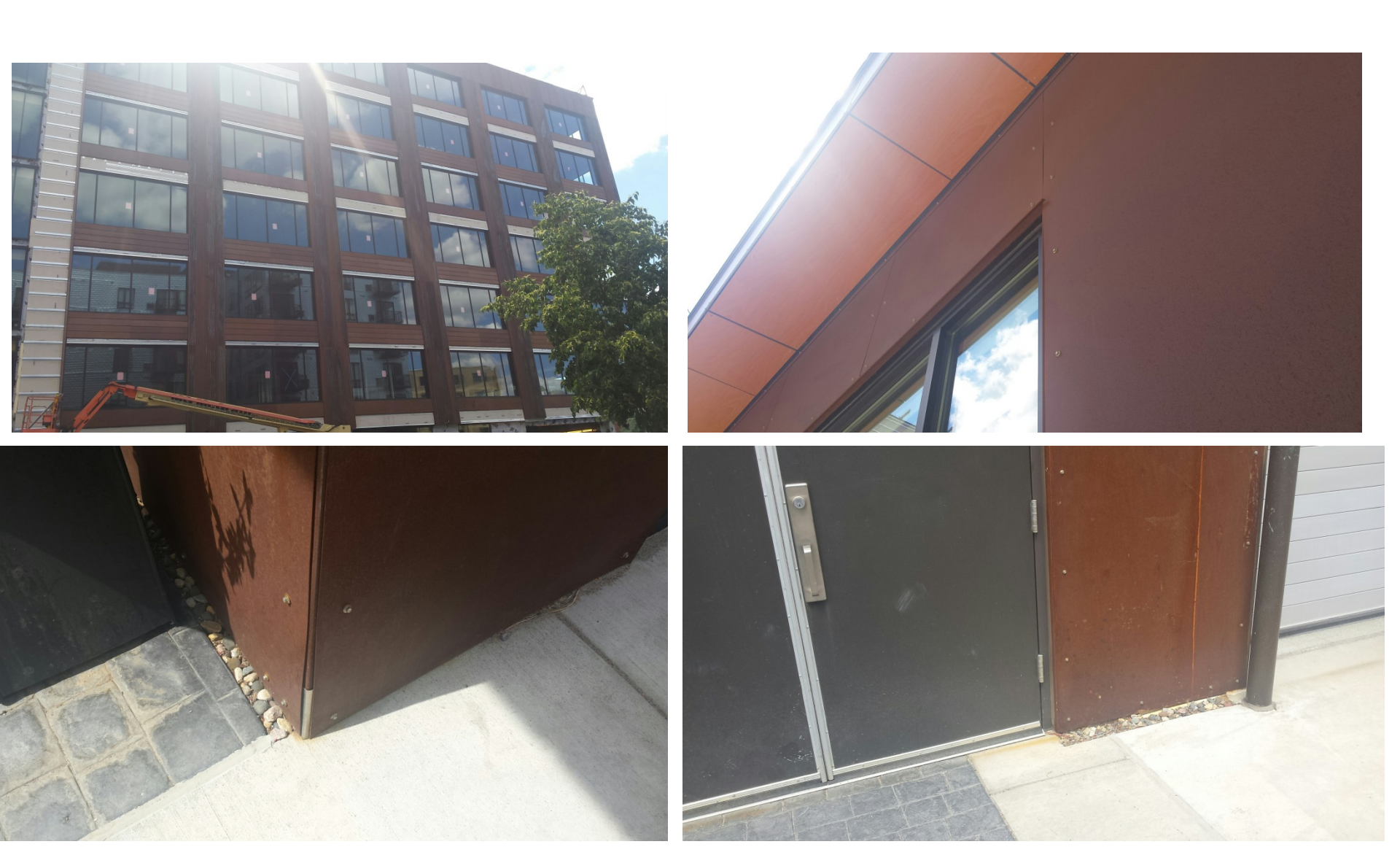
CorTen steel panels in similar climate