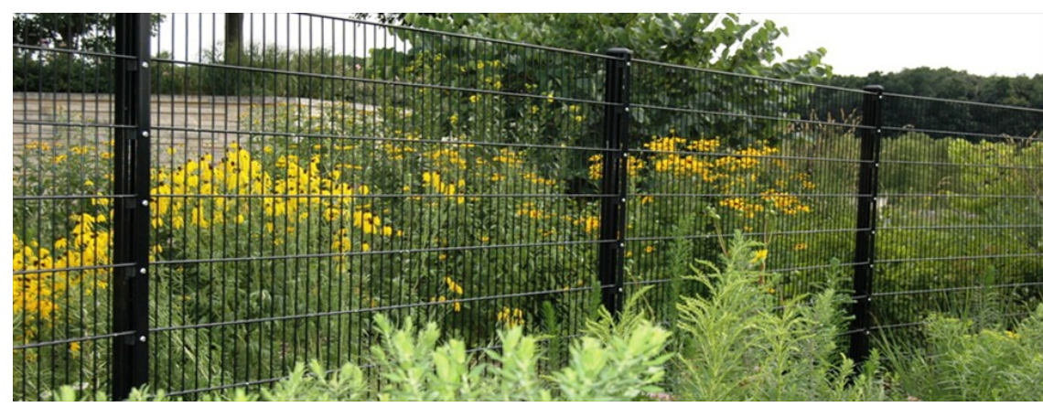
Alternate fencing type along Nakoosa Trail – Ametco Fencing