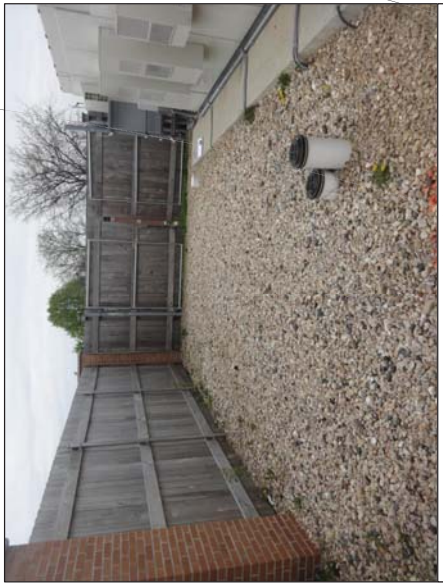
PROPOSED VERIZON PLATFORM LOCATION