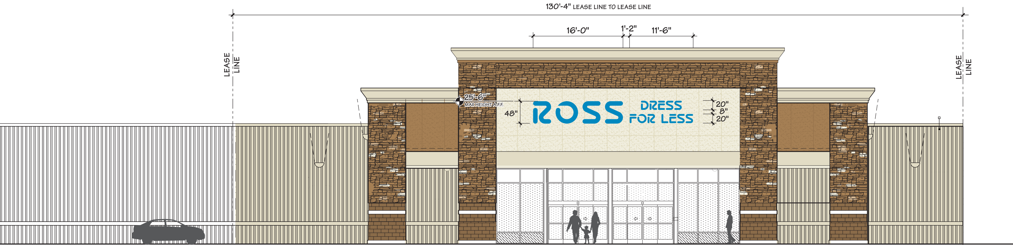
1 STOREFRONT ELEVATION - AS REQUIRED BY CODE (114.7 SQ. FT. SHOWN, 117.7 SQ. FT. ALLOWED)