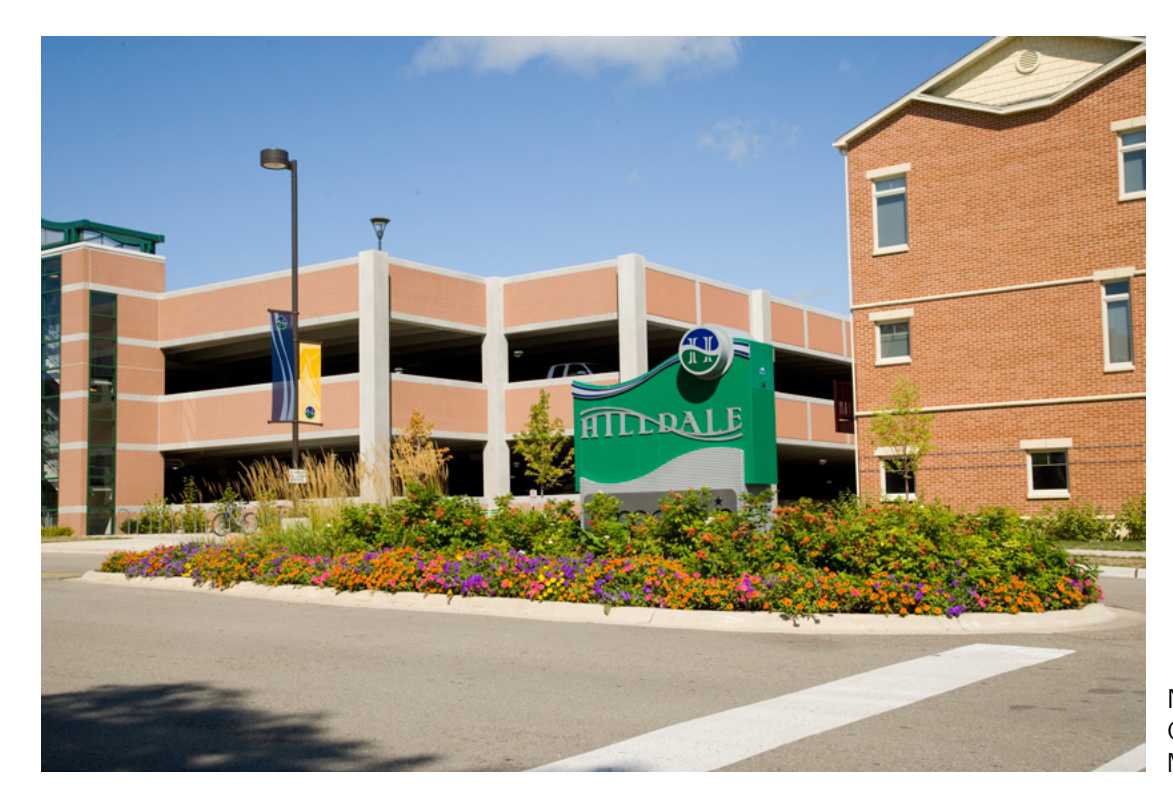
N. Midvale Blvd Central Access Monument Ground Sign