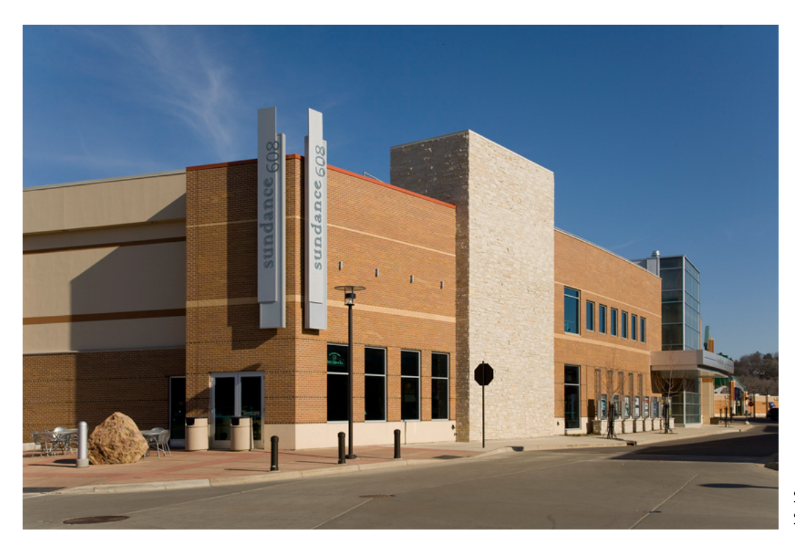
Sundance SE Corner