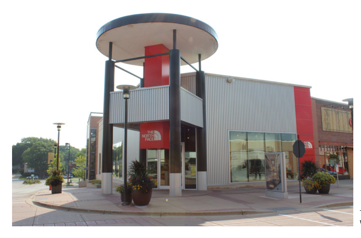
The North Face West Elevation