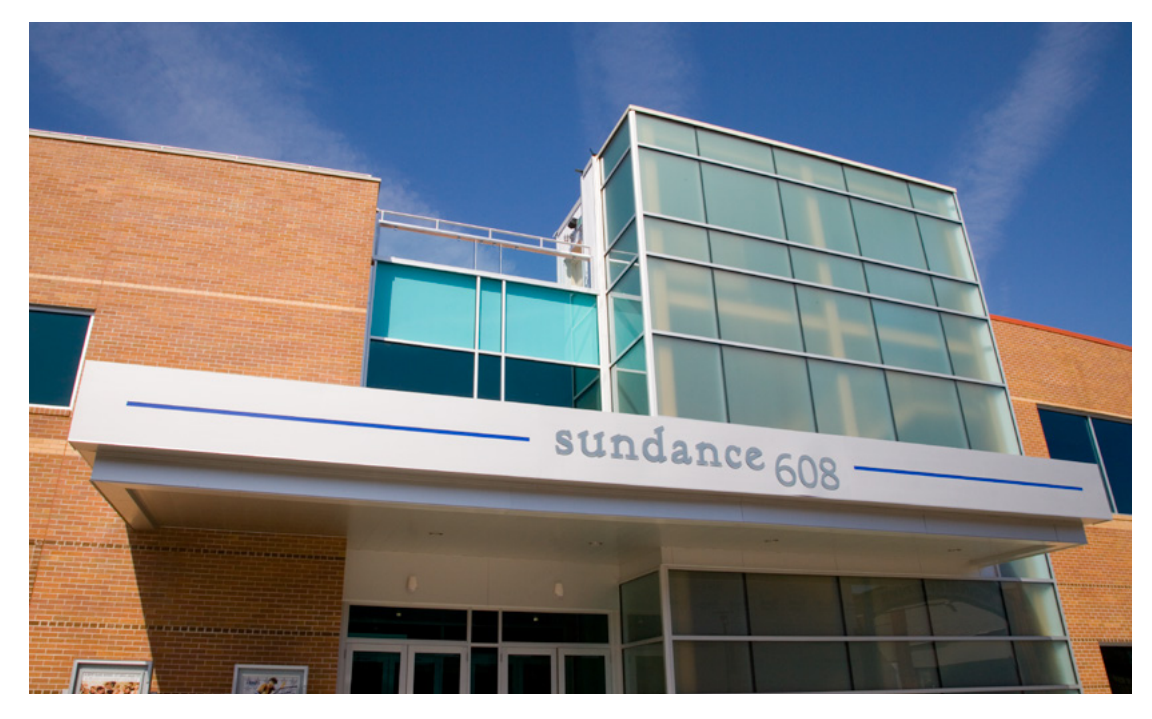
Sundance East Entrance