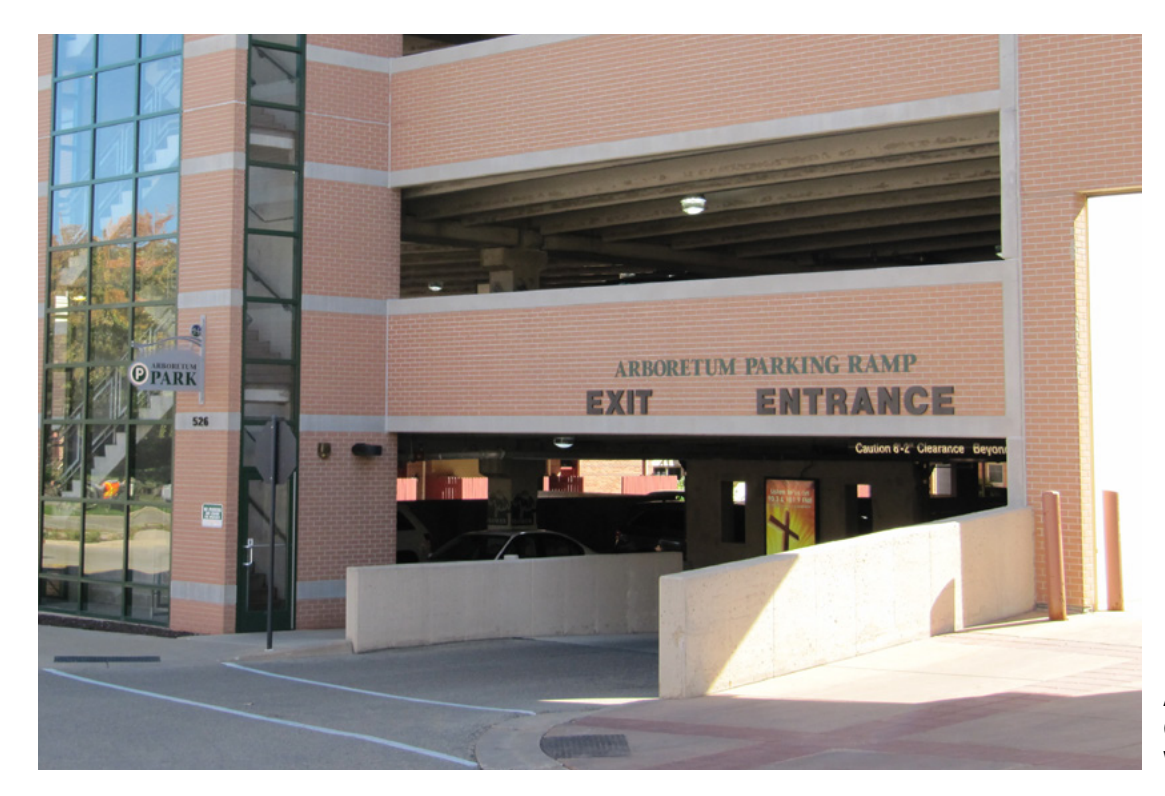
Arboretum Park Garage Entry Wall Sign