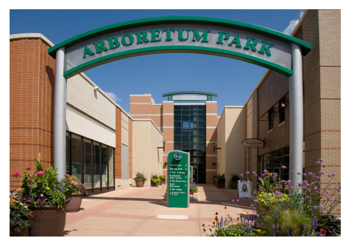
Arboretum Park Garage Entry Sign