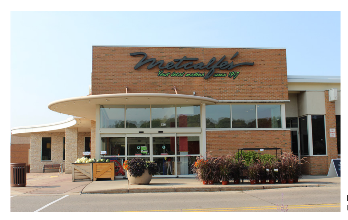
Metcalfes North Frontage