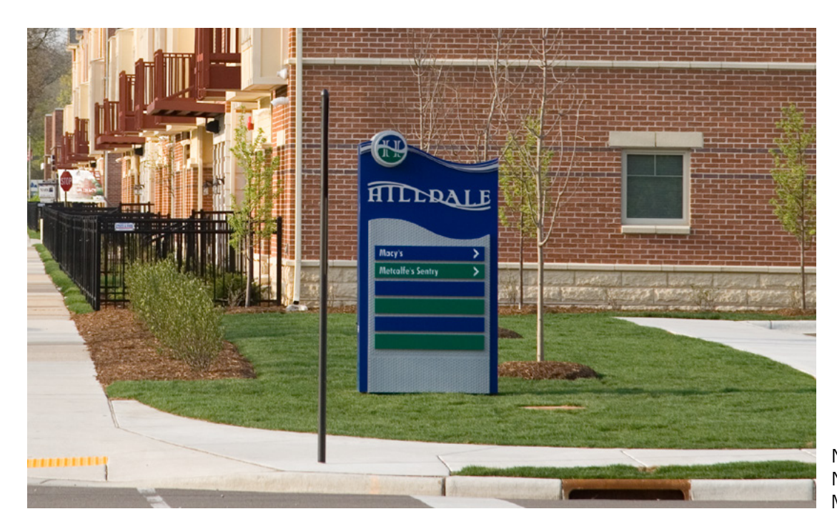
N. Midvale Blvd Northern Access Monument Ground Sign