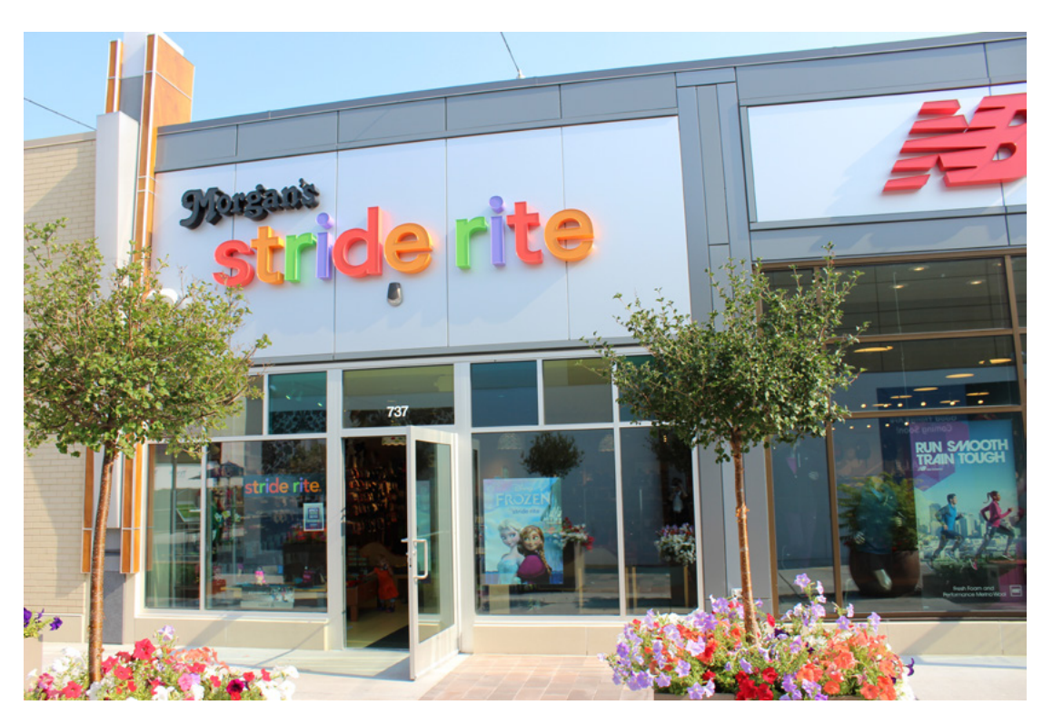
Stride Rite - Morgan's