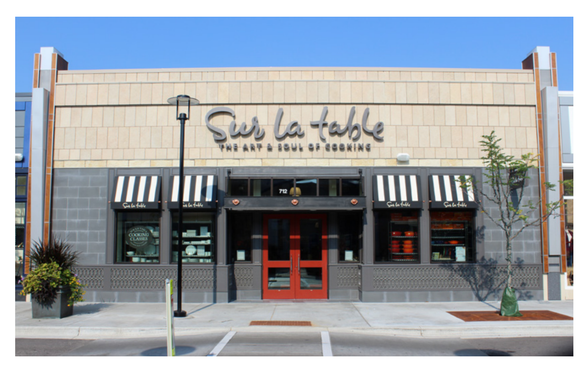
Sur la Table