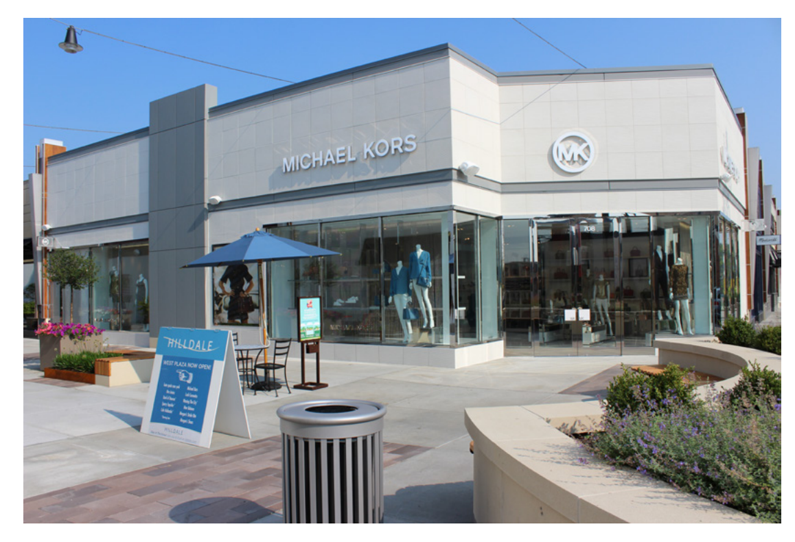
Michael Kors South Elevation