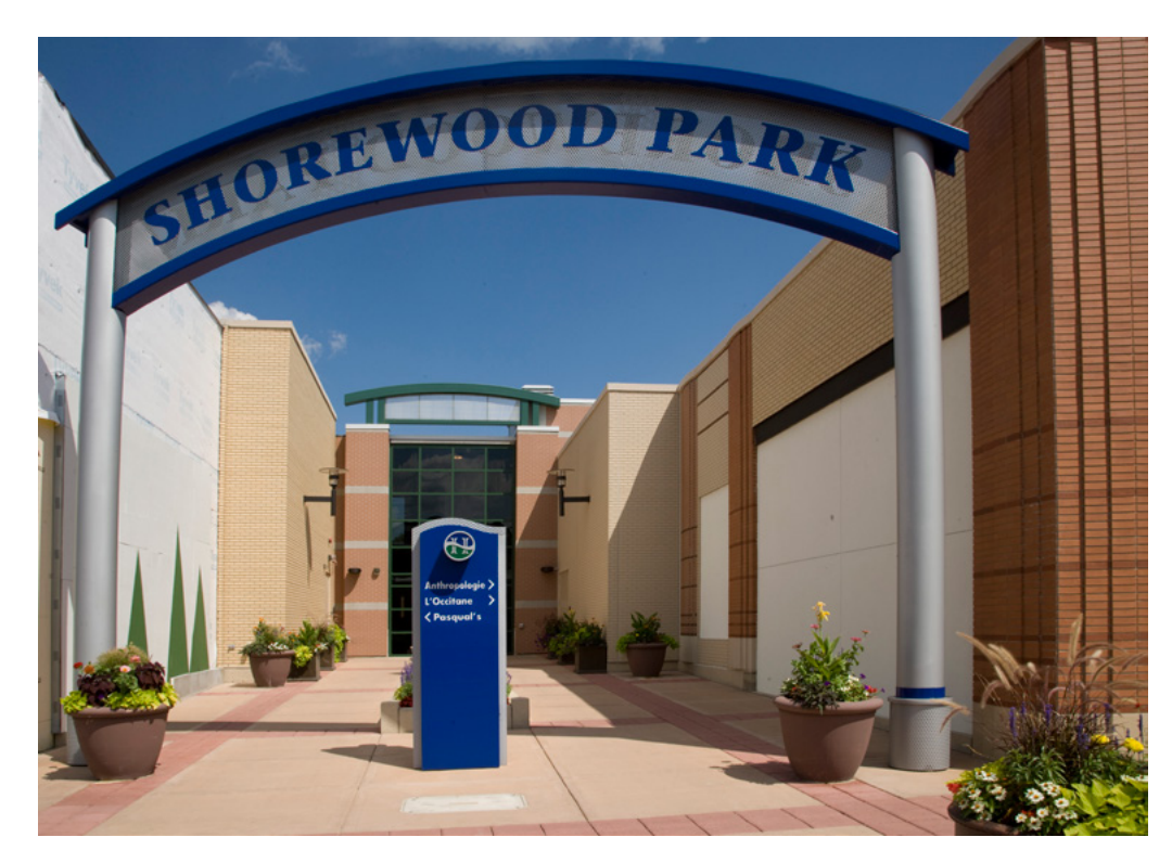
Shorewood Park Garage Entry Sign