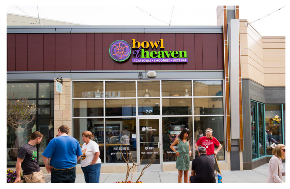
Bowl of Heaven