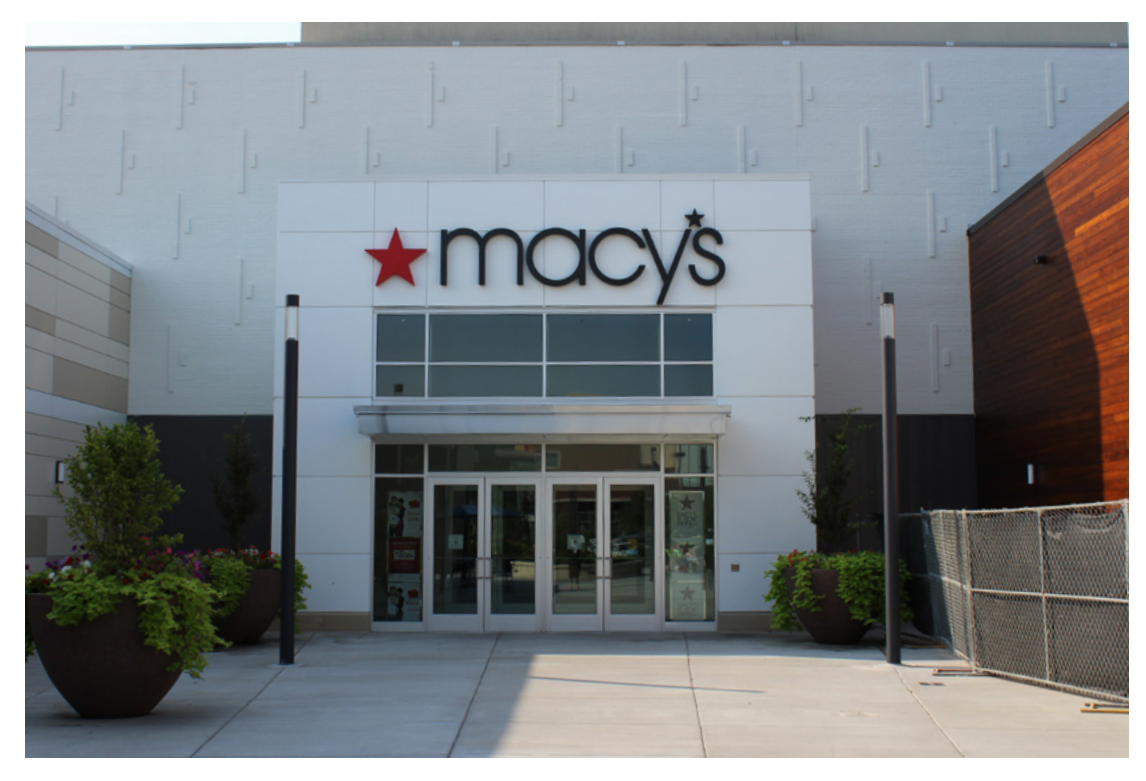
Macy's North Entrance