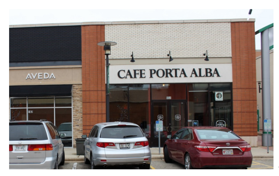
Cafe Porta Alba