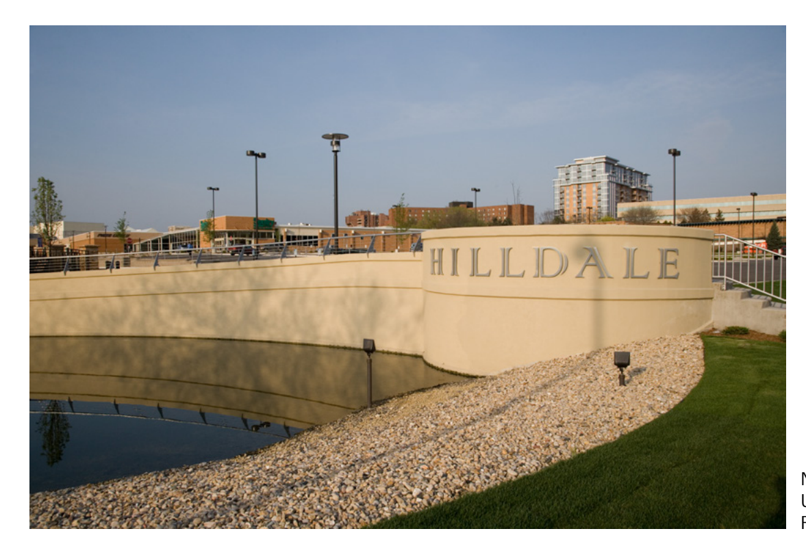
N. Midvale Blvd & University Ave Intersection Fountain & Sign