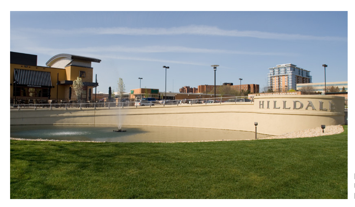
N. Midvale Blvd & University Ave Intersection Fountain & Sign