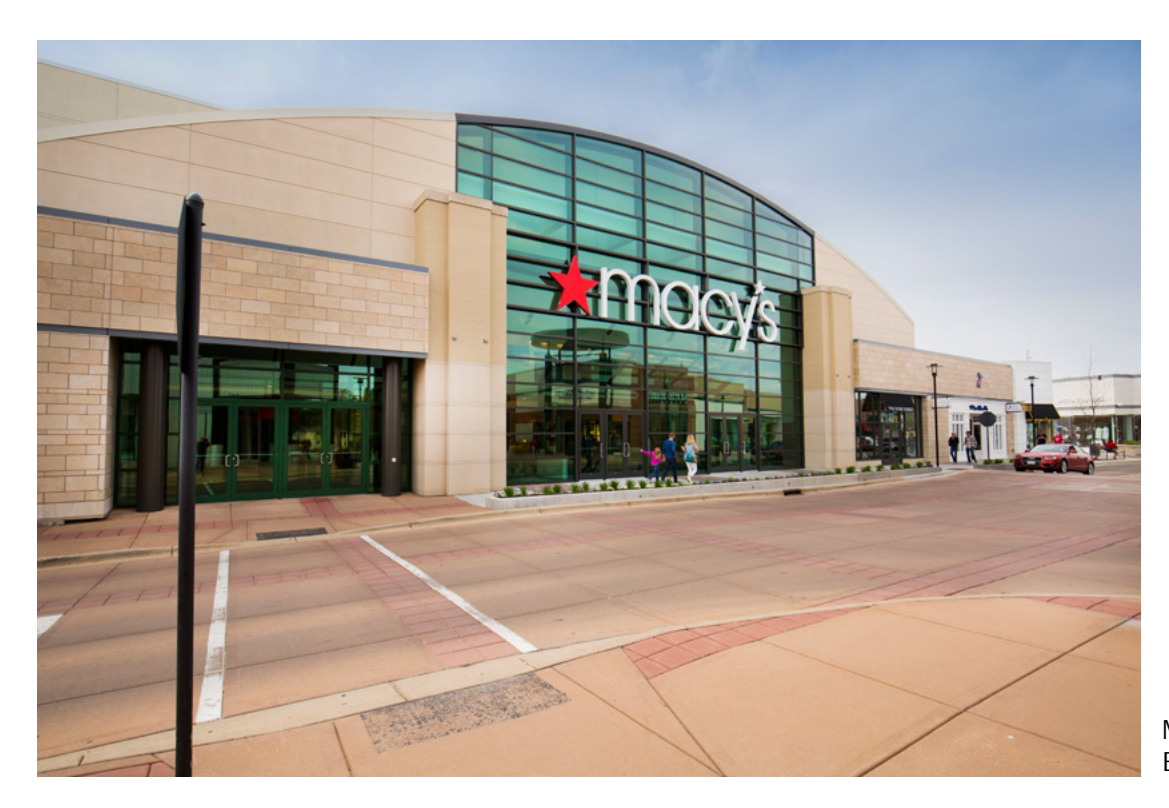
Macy's East Frontage