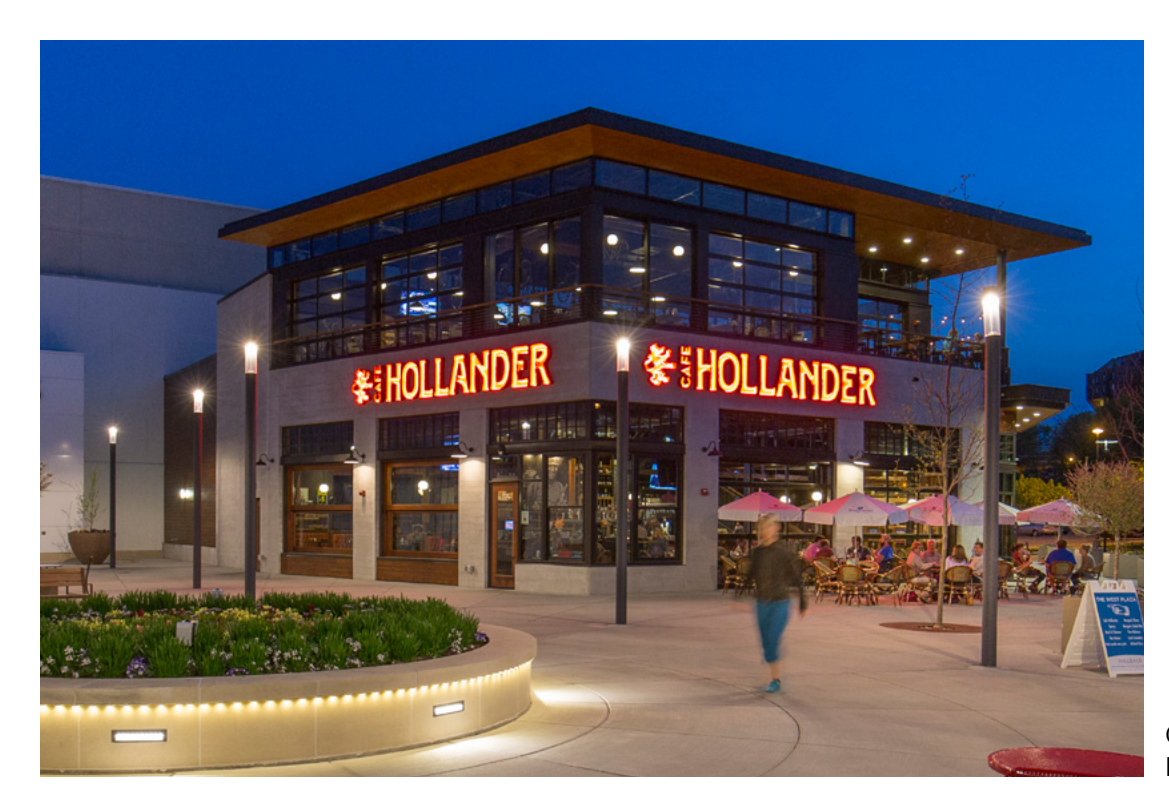
Cafe Hollander North East Corner