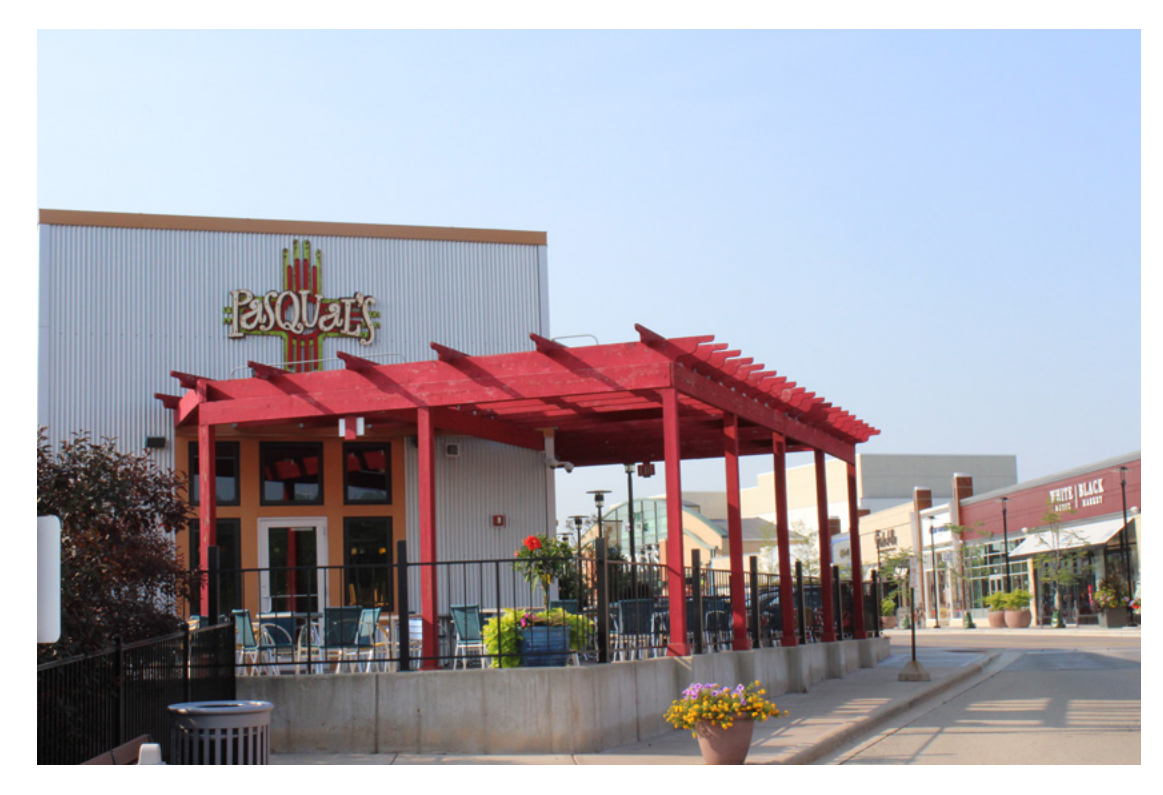
Pasqual's North Elevation