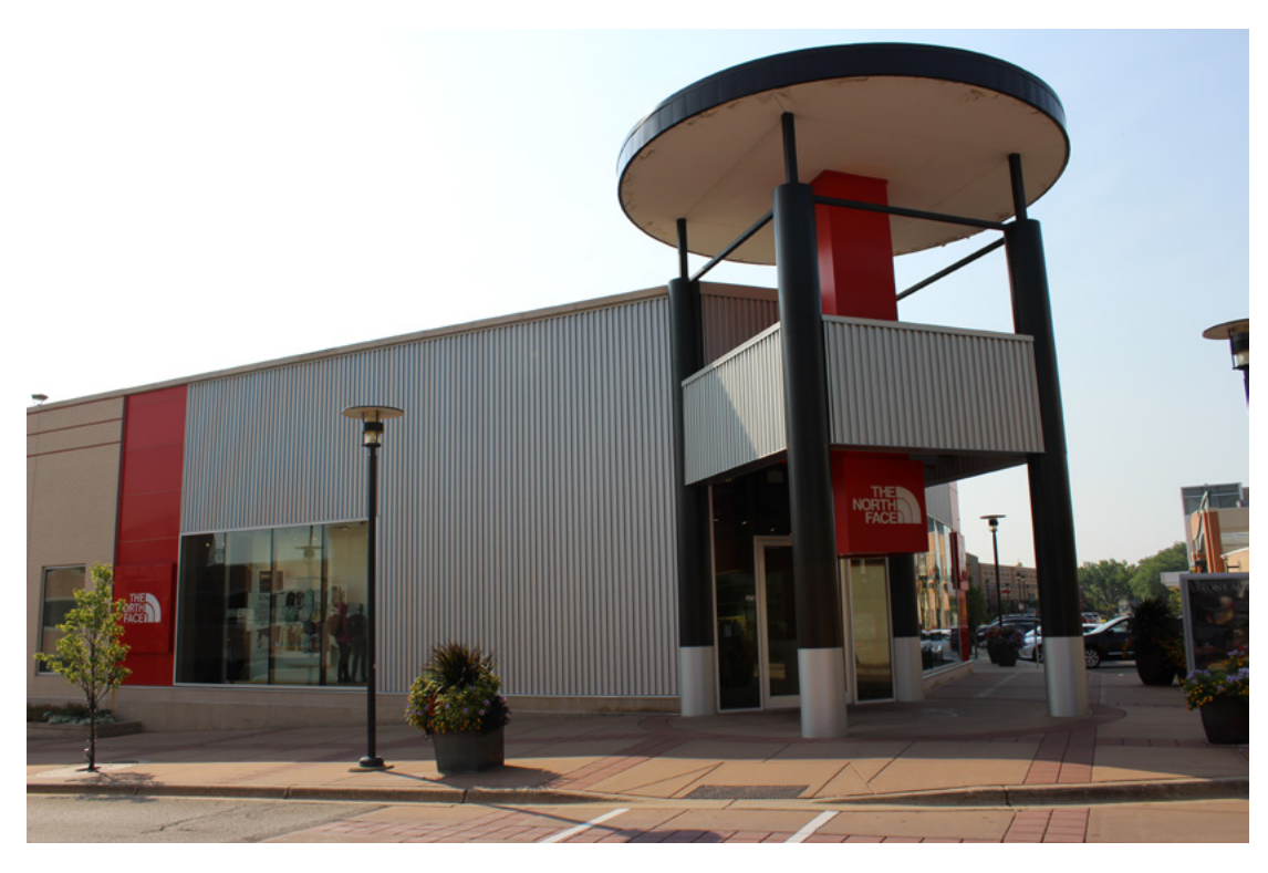
The North Face North Elevation