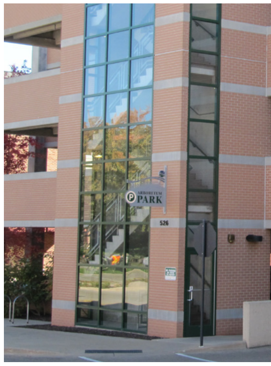
Arboretum Park Projecting Sign