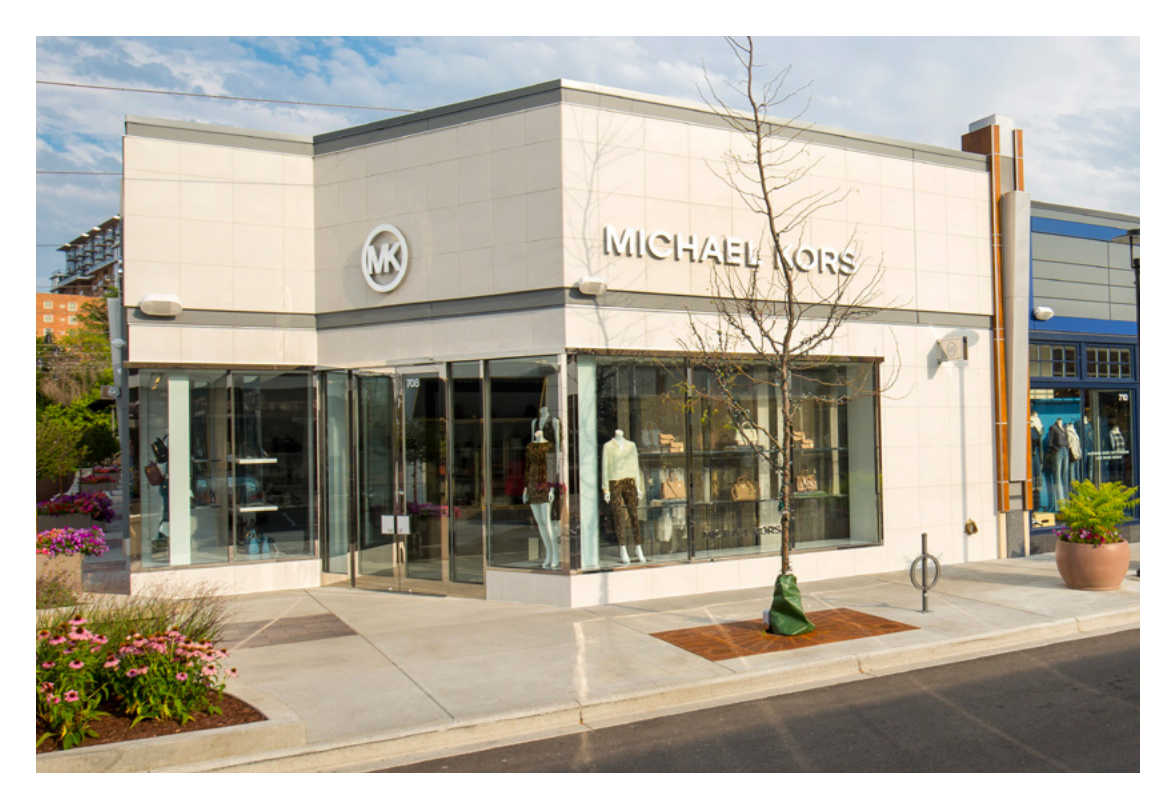
Michael Kors East Elevation