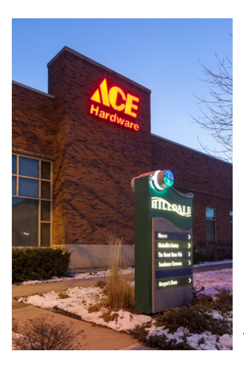
Ace Hardware North Elevation