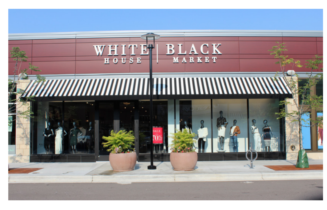
White House Back Market