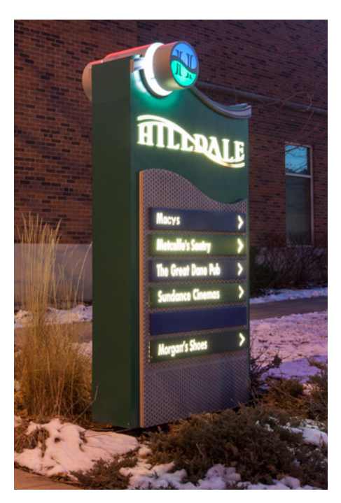
N. Midvale Blvd Southern Access Monument Ground Sign