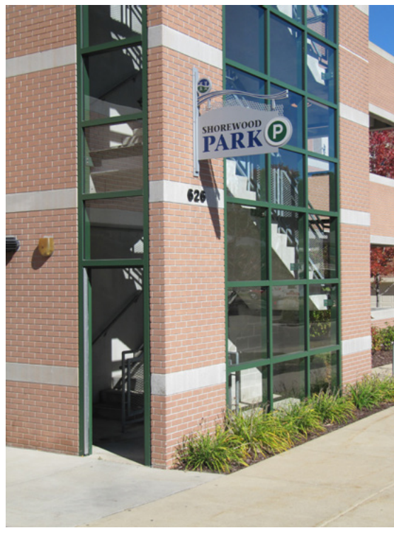
Shorewood Park Projecting Sign