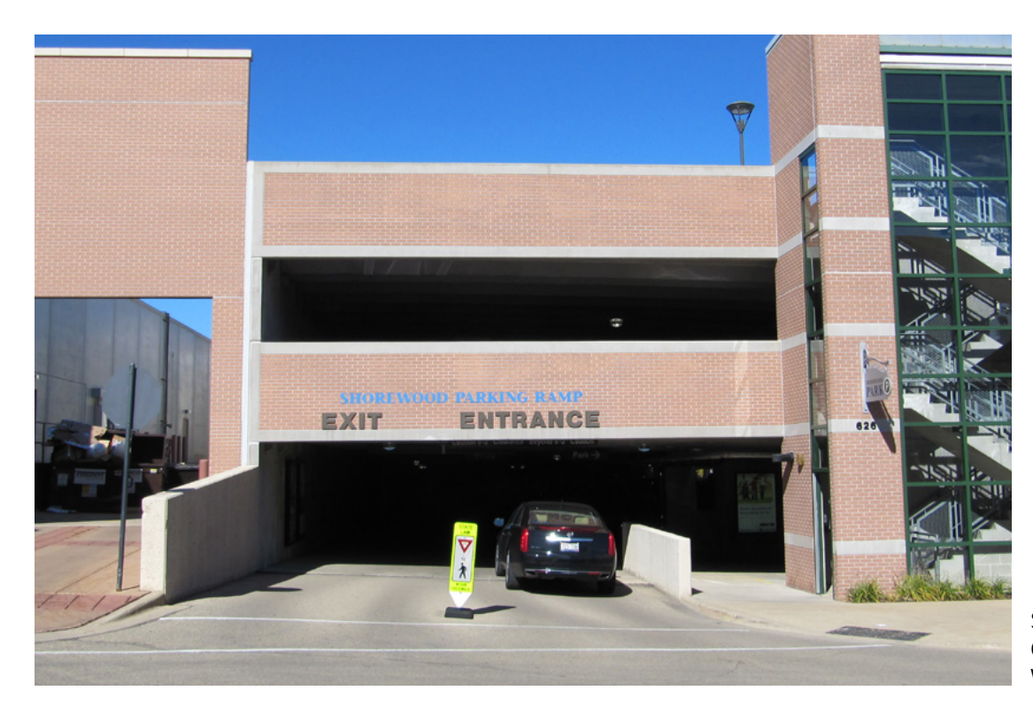
Shorewood Park Garage Entry Wall Sign